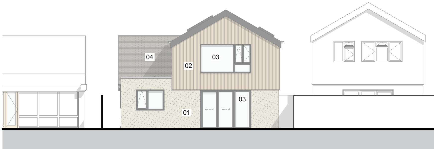
(West) Rear Elevation