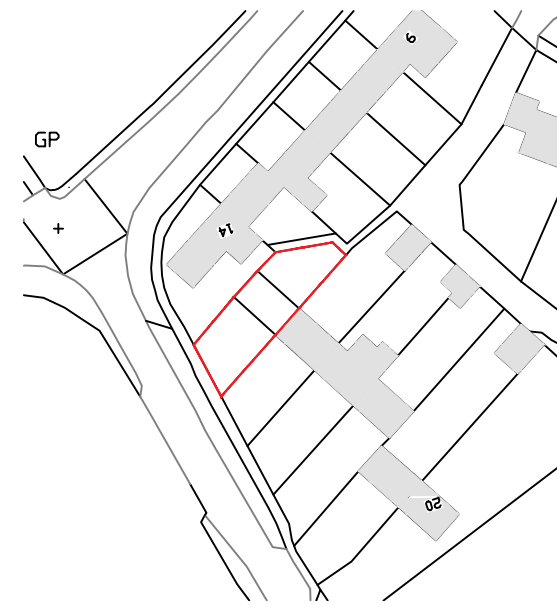
Site Location Plan (Existing) Scale 1:1250