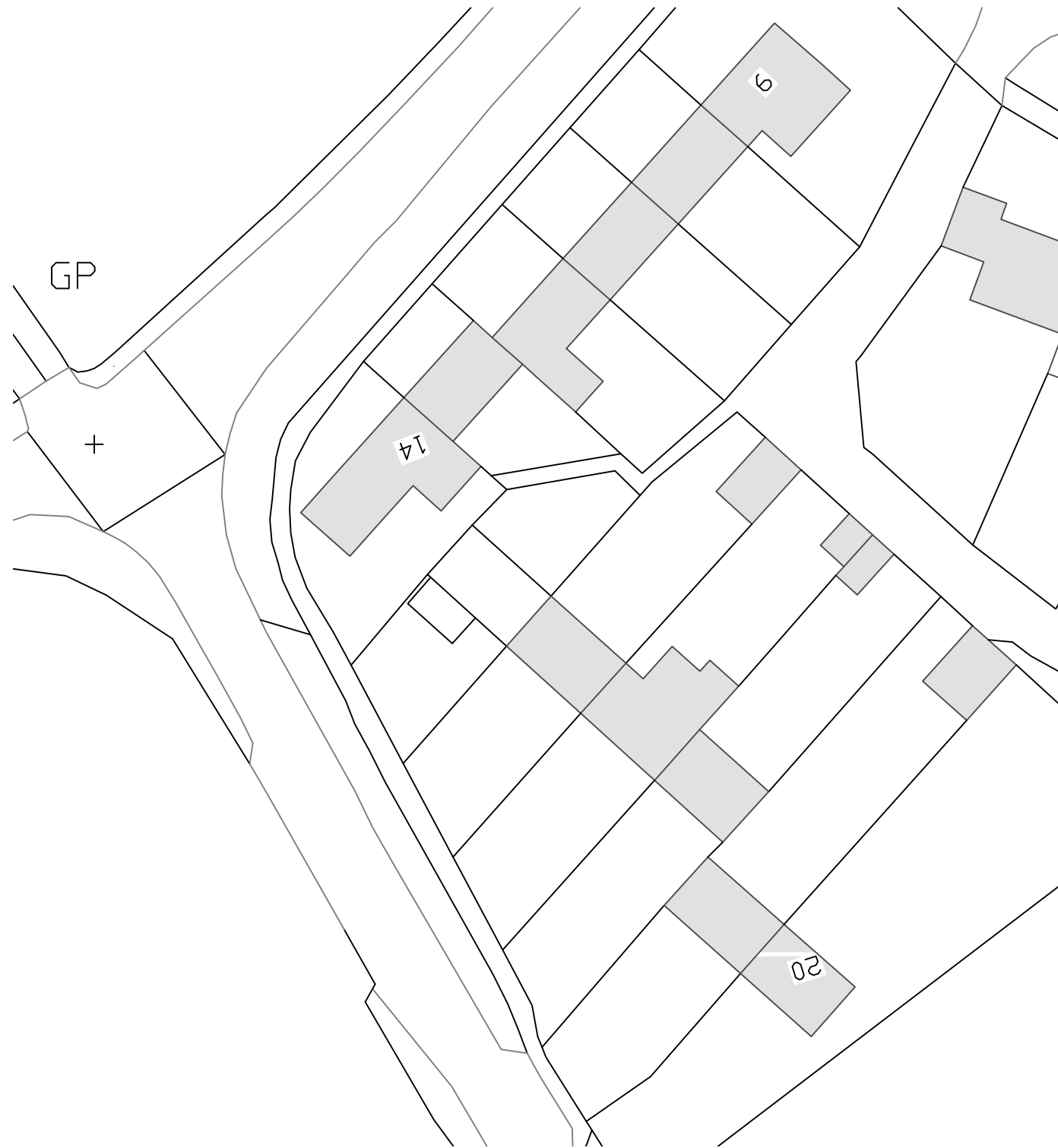
Block Plan (Proposed) Scale 1:500