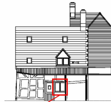
REAR ELEVATION AS EXISTING 1:100