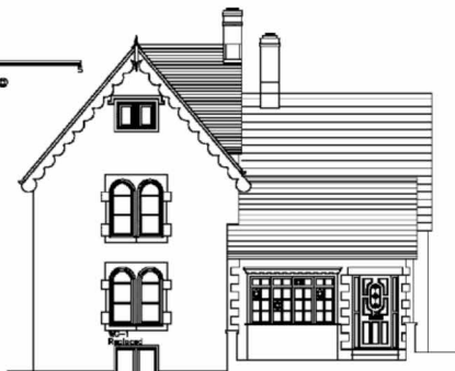
FRONT ELEVATION AS EXISTING 1:100