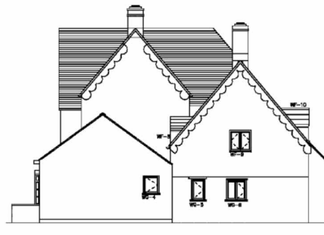
SIDE ELEVATION AS EXISTING (EAST) 1:100