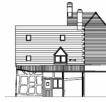
REAR ELEVATION AS EXISTING 1:100