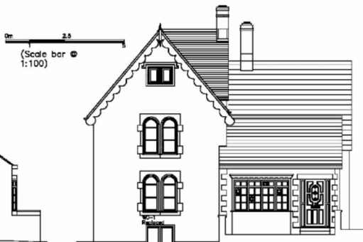
FRONT ELEVATION AS EXISTING 1:100