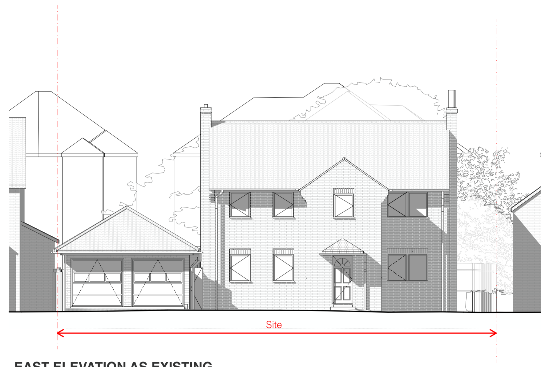
EAST ELEVATION AS EXISTING 1:100@A1