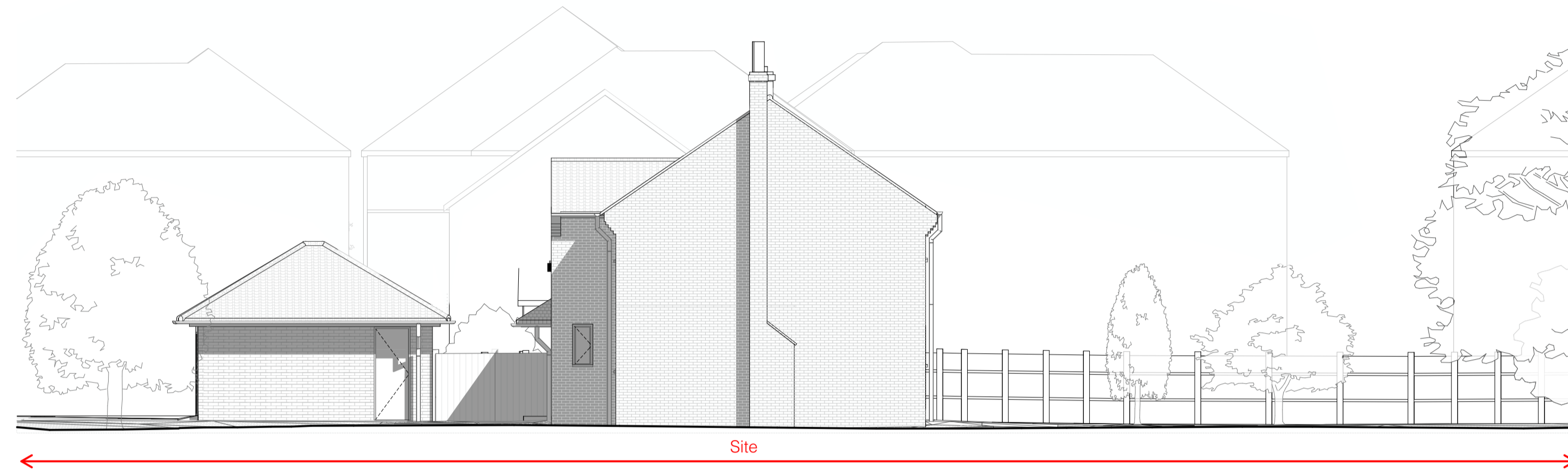
NORTH ELEVATION AS EXISTING 1:100@A1