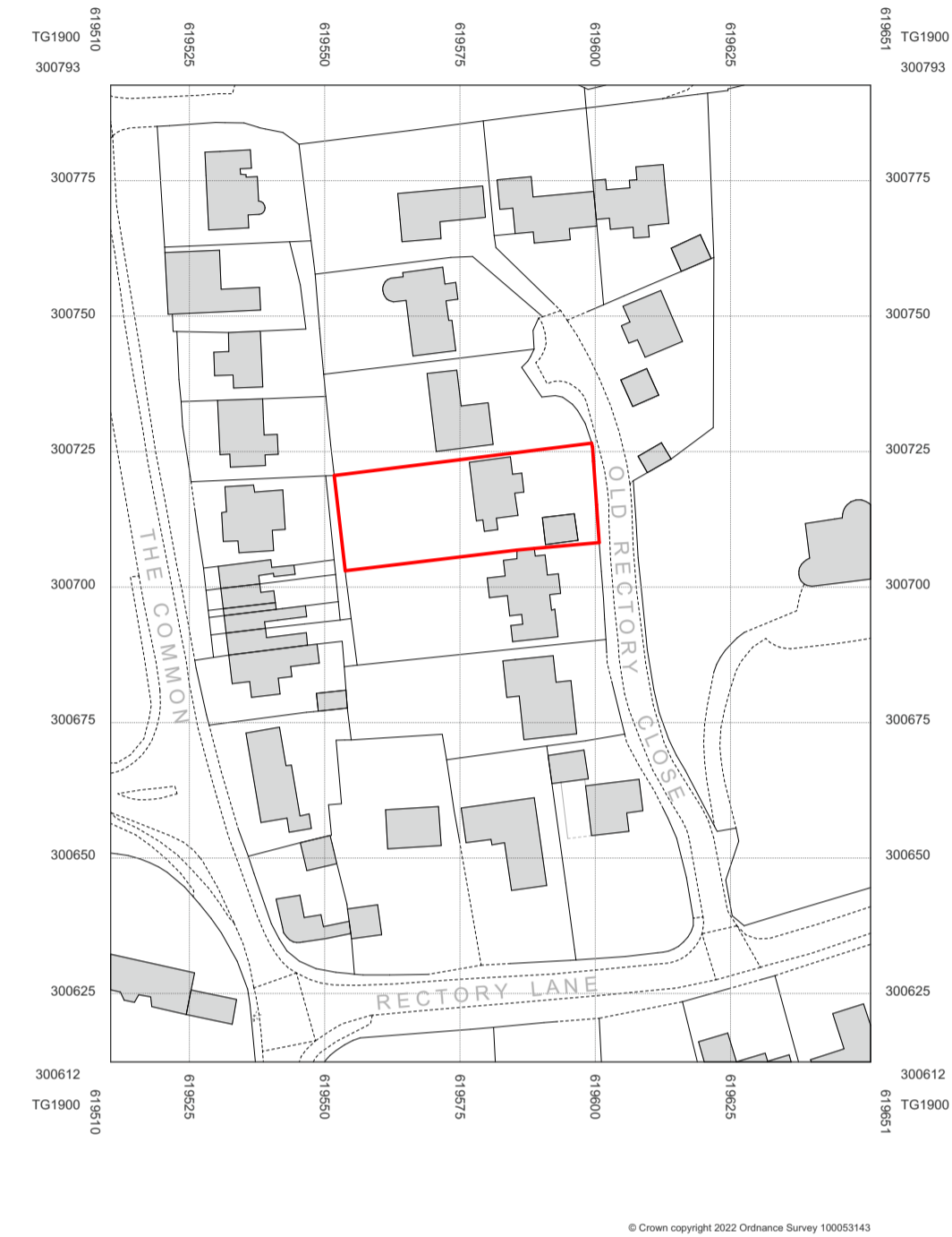
SITE LOCATION PLAN AS EXISTING 1:1250@A1

NOTES: The site location plan has been produced from an Ordnance Survey Map and should be used for illustration purposes only. The site plan has been drawn from survey information produced by Survey Solutions, received 04.07.2022. This drawing should be used for planning purposes only.