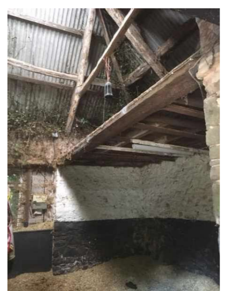
Photographs (Left) Outside view of the south east elevation (Right) Internal view from stables floor to loft

NOTES: STATUS : FOR APPROVAL Do not scale from this drawing. Use only figured dimensions and check all discrepancies with architect. This drawing is not intended for construction purposes. Roofing sheet to be checked for COSHH substances prior to any construction work. If asbestos is discovered, this to be dealt with by specialist.