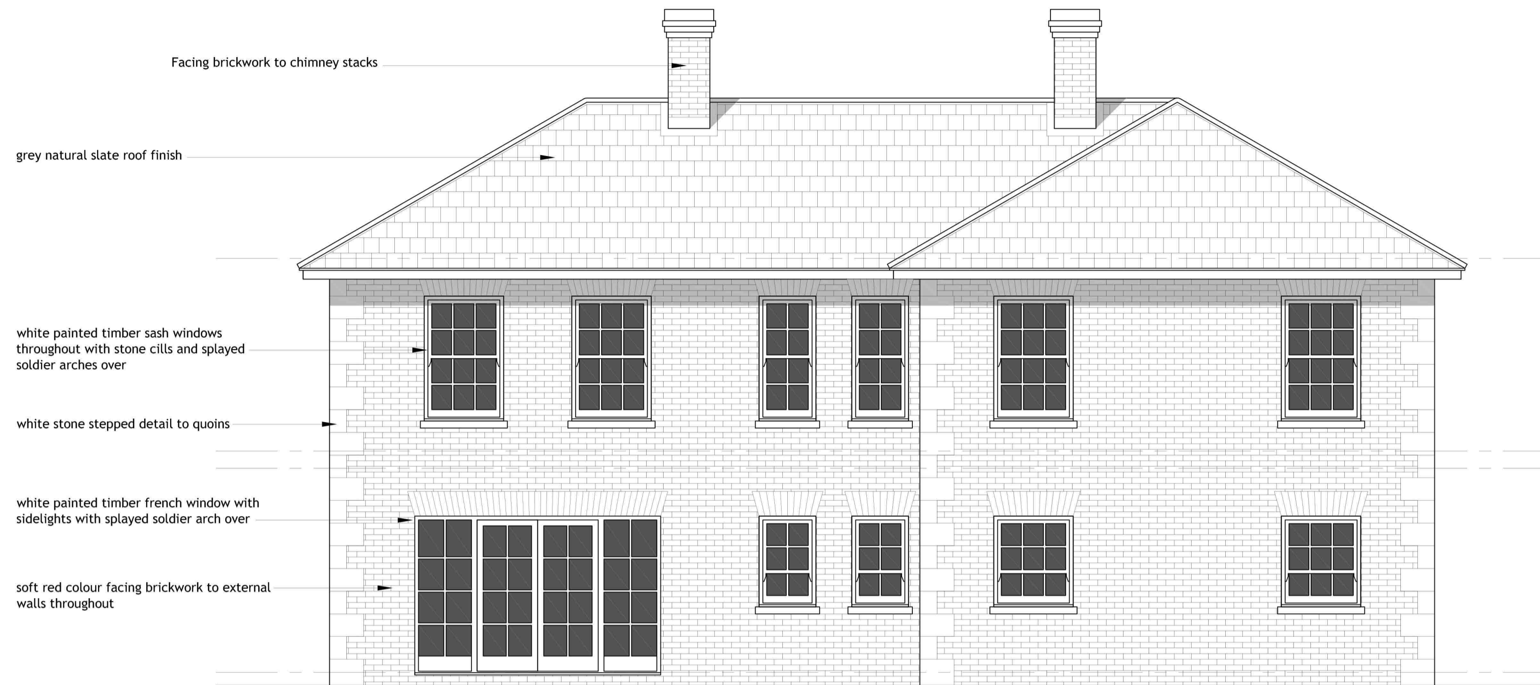
SOUTH ELEVATION AS PROPOSED 1:50