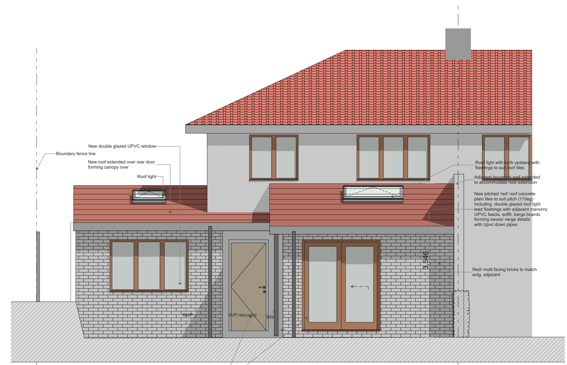
3 Elevation_Rear 1:50