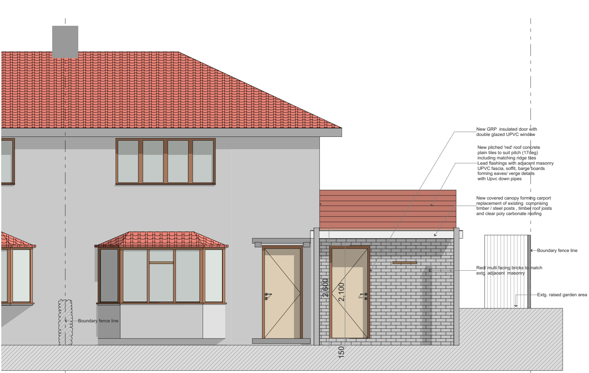
2 Elevation_Front 1:50