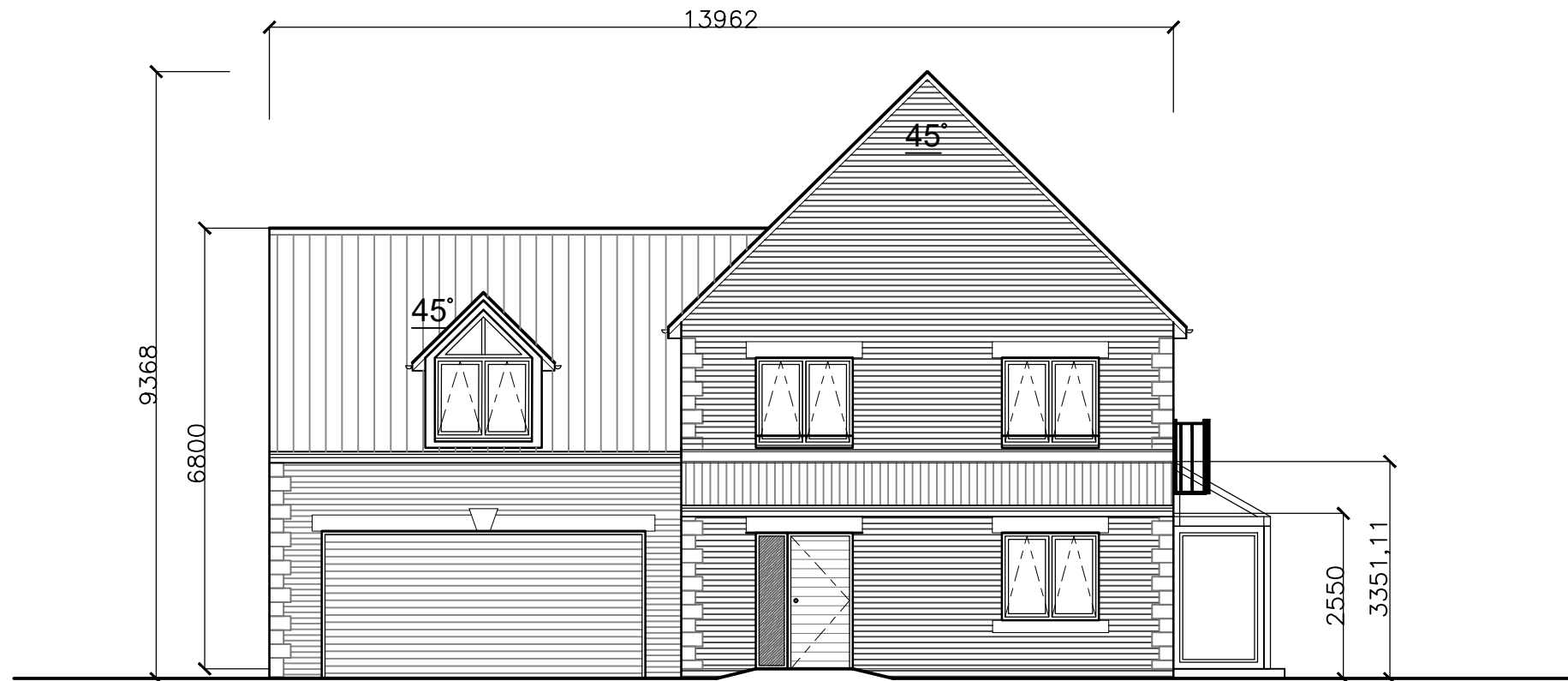
Proposed Front Elevation - West Facing