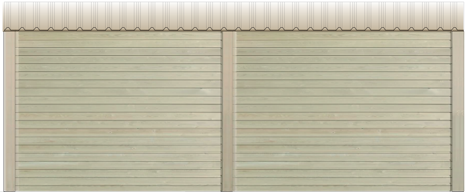
Solid wood wall along entire rear of building