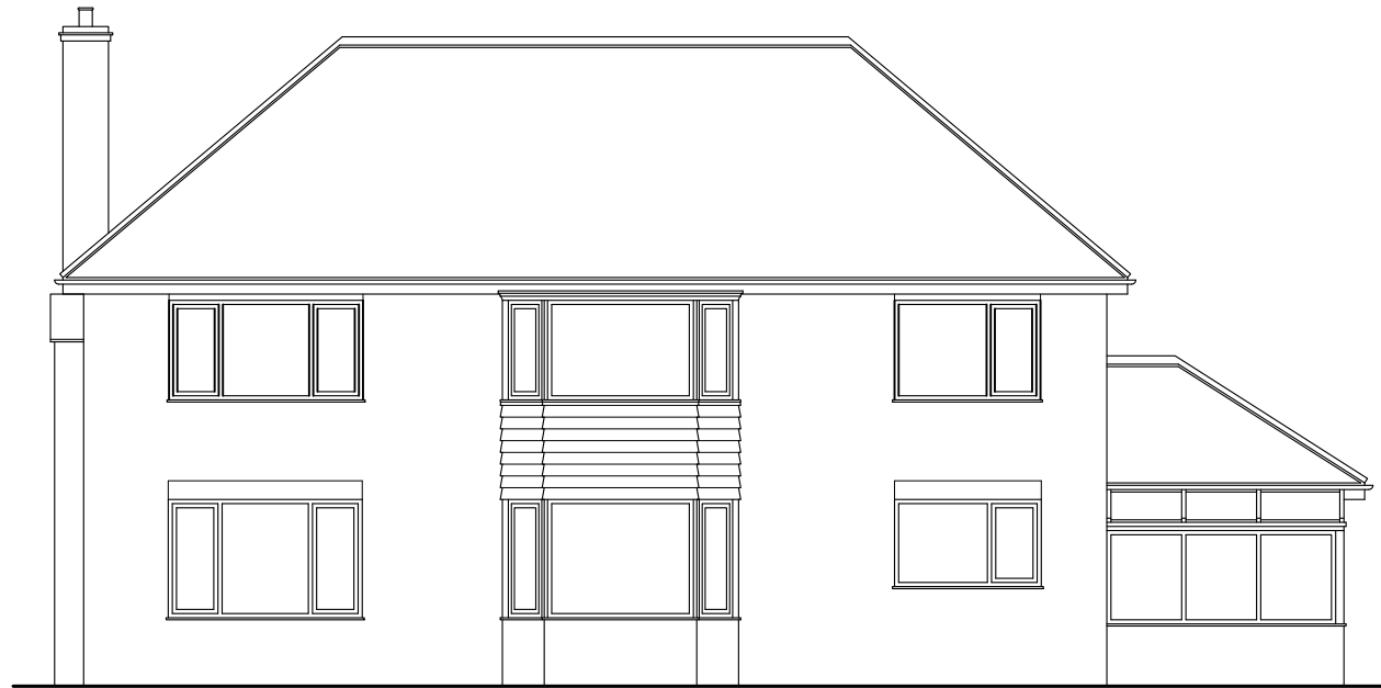
FRONT ELEVATIONS 1:100