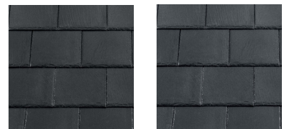
Slate Grey Code: 10001760