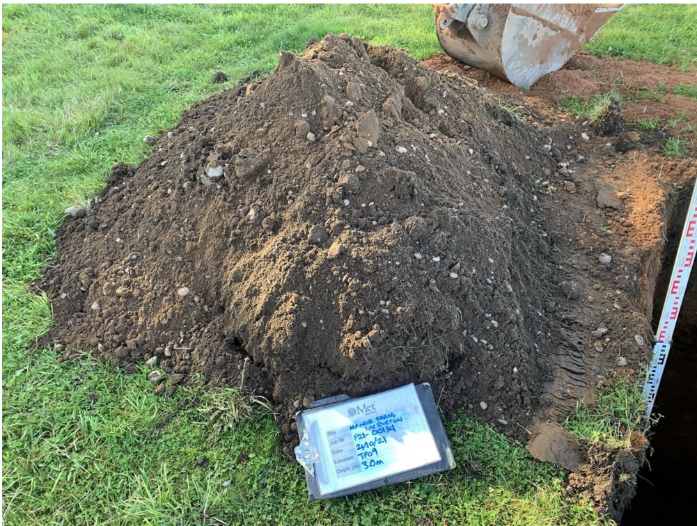
Photograph 27: TP08. Topsoil Arisings.