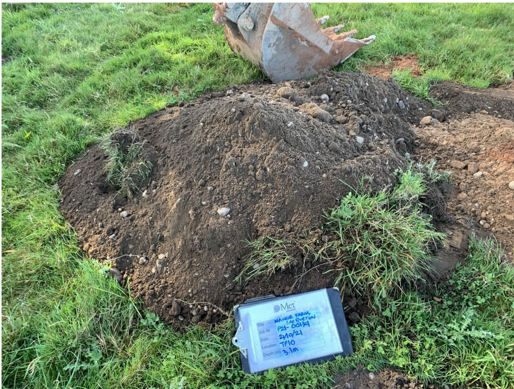
Photograph 30: TP10. Topsoil Arisings.