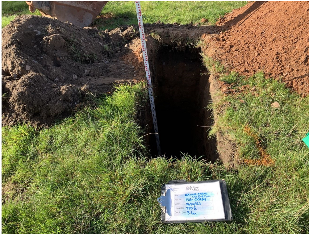
Photograph 23: TP08. Trial Pit.