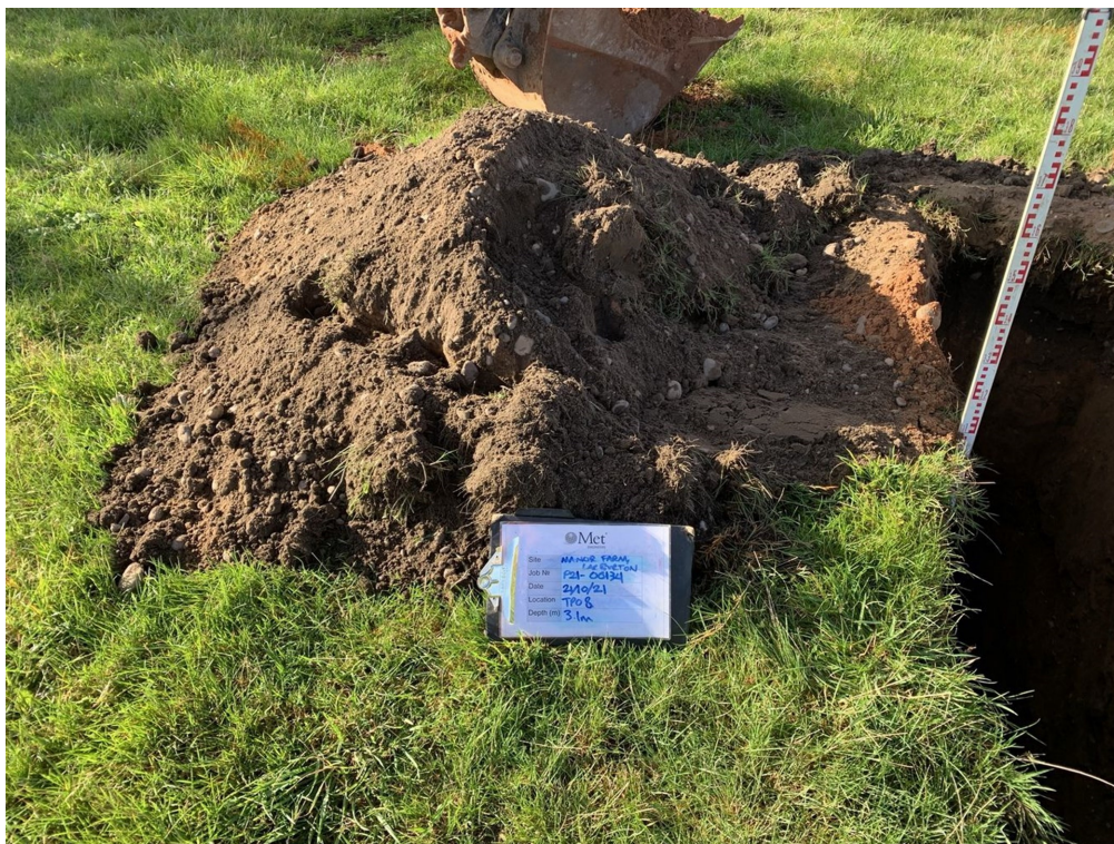
Photograph 24: TP08. Topsoil Arisings.