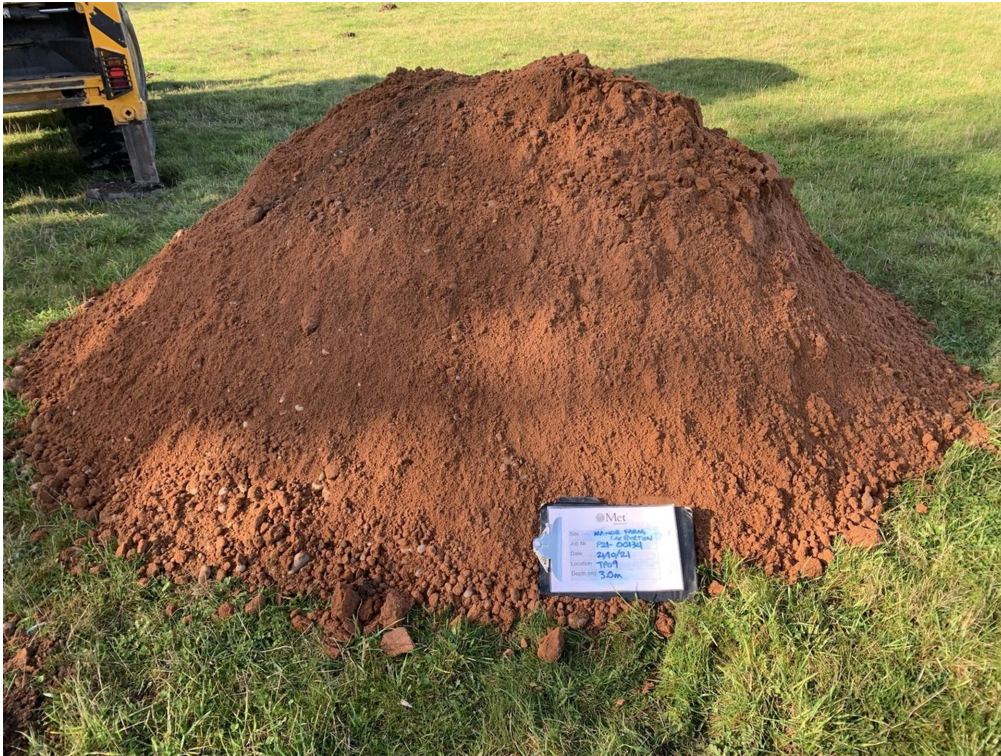
Photograph 28: TP09. Arisings.