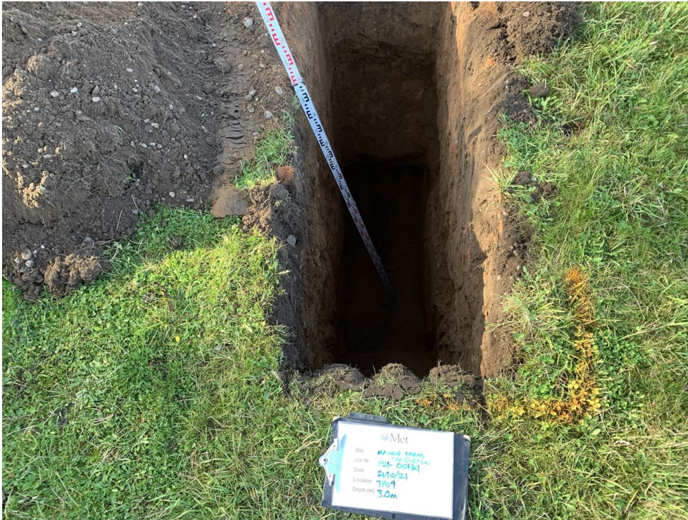
Photograph 26: TP09 . Trial Pit.