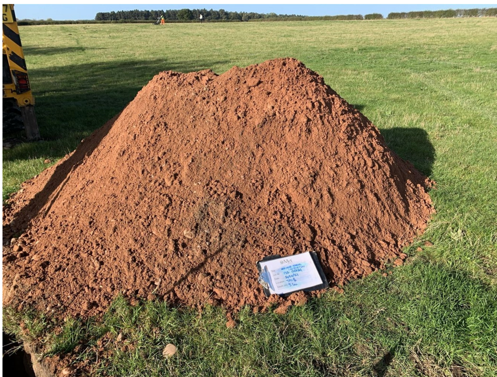
Photograph 25: TP08. Arisings.