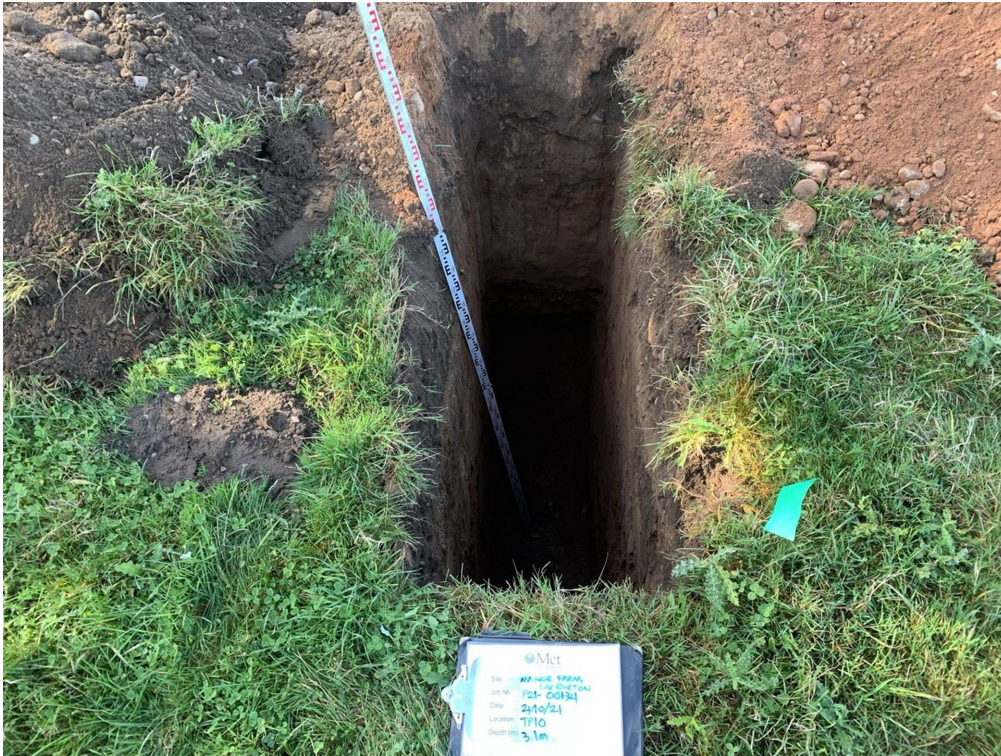
Photograph 29: TP10. Trial Pit.