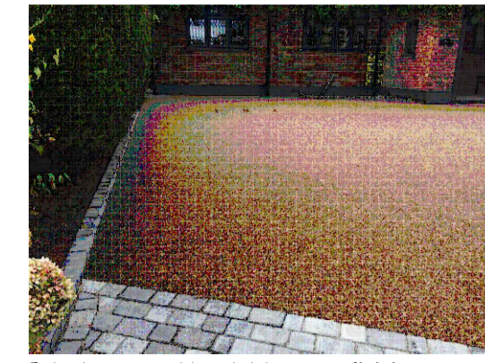
Private car parking / driveways finish. Resin bonded gravel, colour to LA requirements, with granite sets crossovers and edgings.