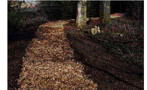
Landscaped footpath South of private drive. Woodchip finished footpath within soft landscaping zone.