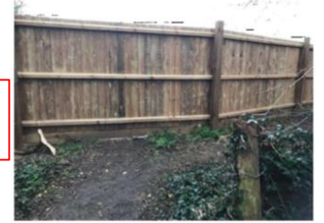
EXISTING Views towards CA already blocked by fence along footpath