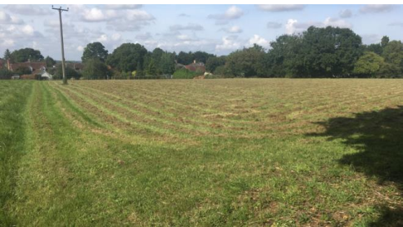
Left: Examples of views towards the back of High Street/Conservation Area which would remain unaffected by the proposed development, in the transition area. These views are what the inspector was concerned about in the 20 unit appeal scheme. Matter now resolved.