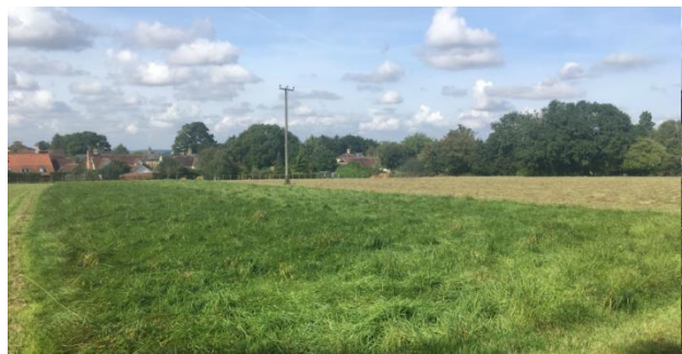
EXISTING Views towards site and CA already limited by trees and vegetation