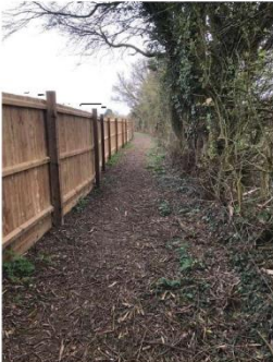
EXISTING Views towards CA already blocked by fence along footpath