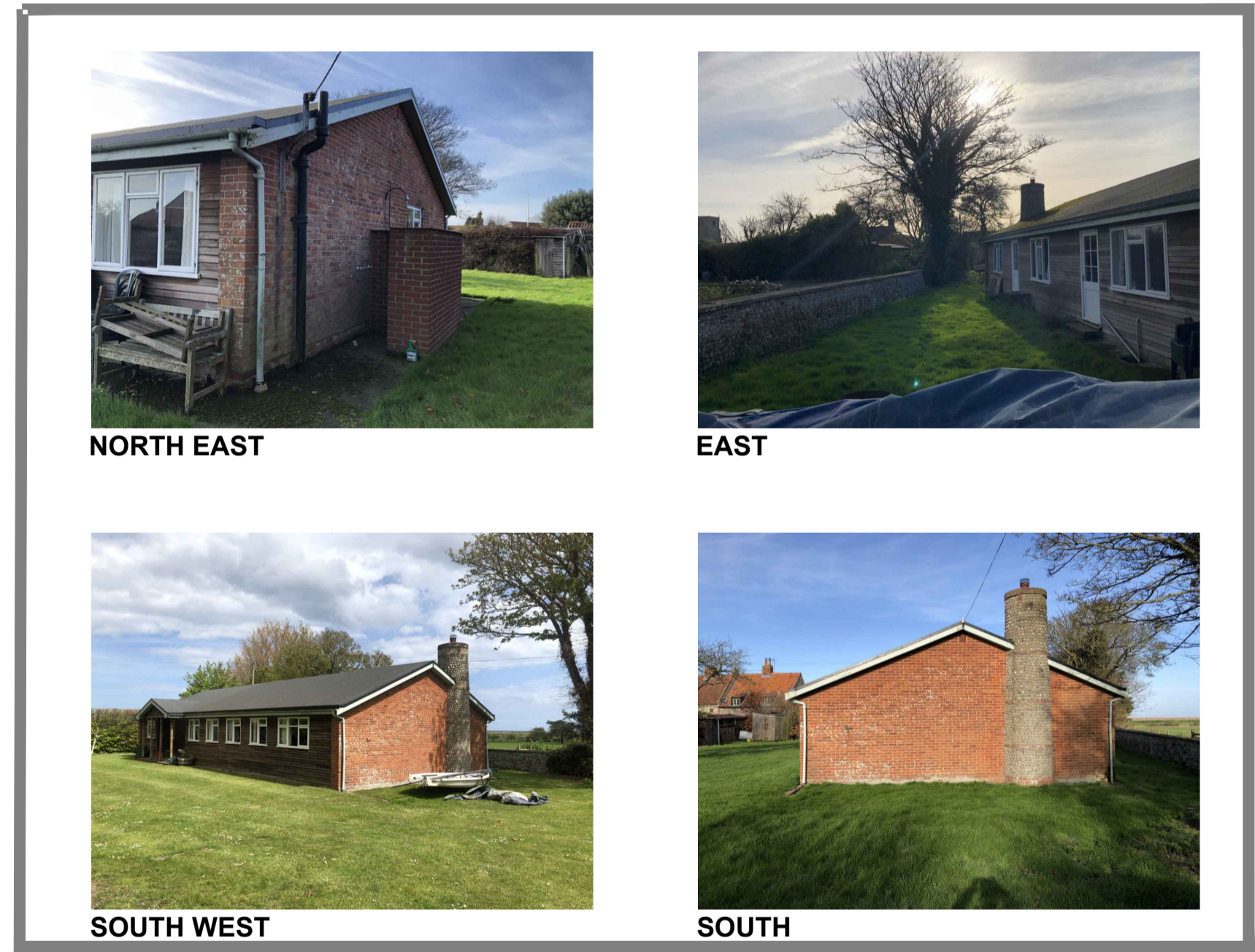
PHOTOS OF EXISTING DWELLING