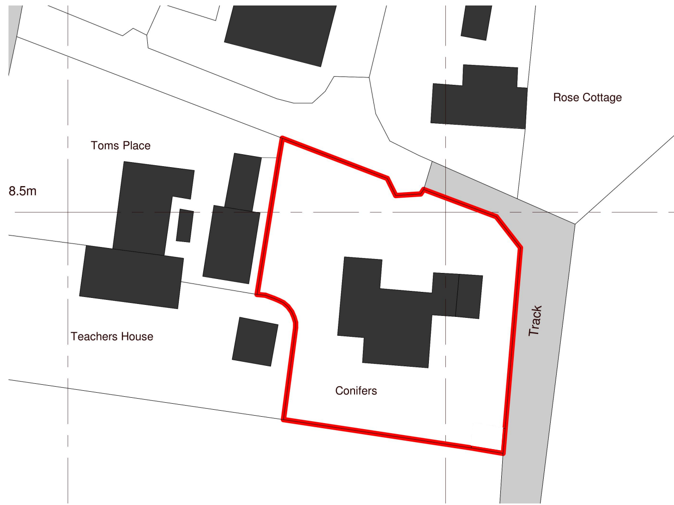
SITE BLOCK PLAN Scale 1:500