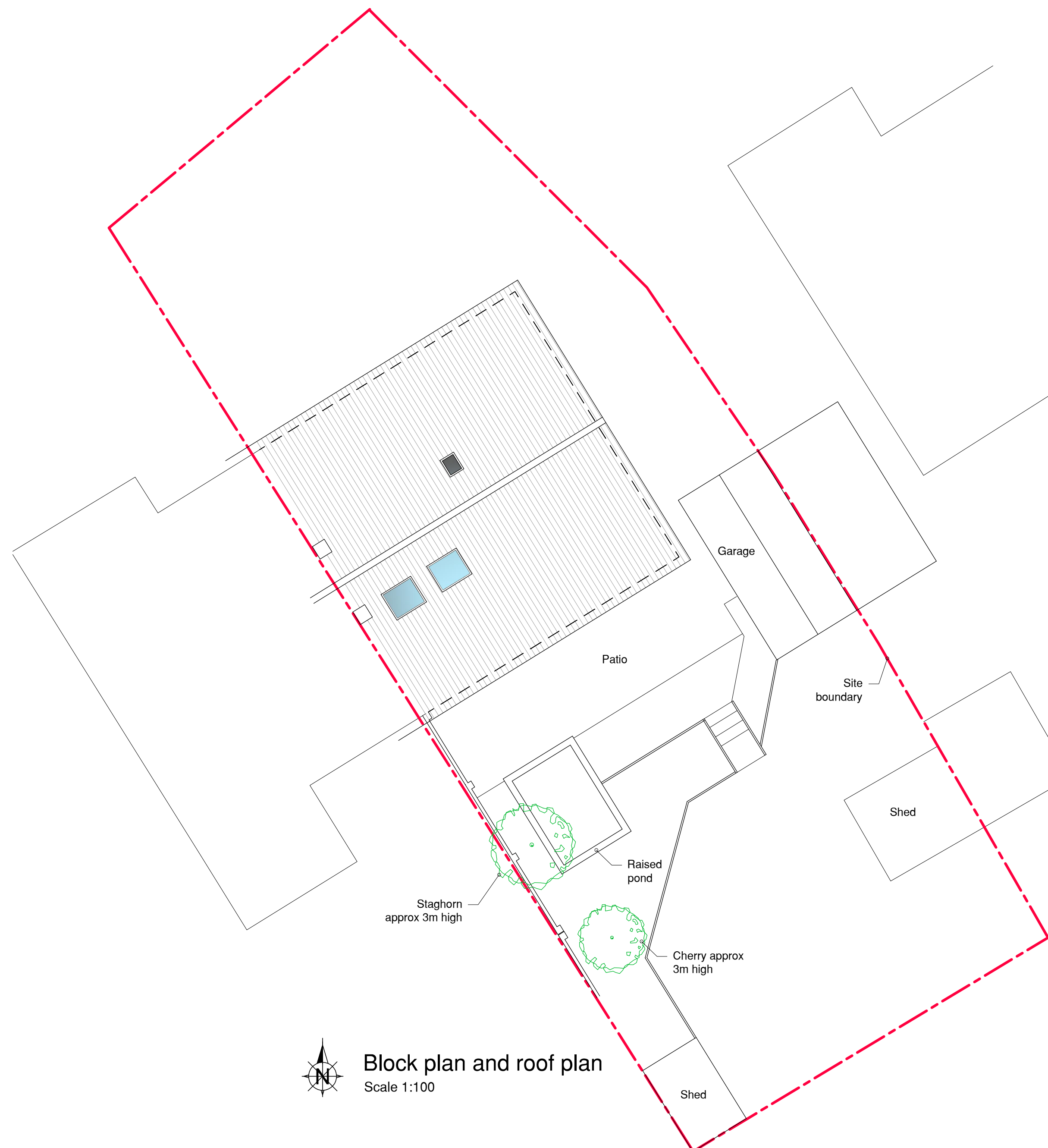
Block plan and roof plan Scale 1:100