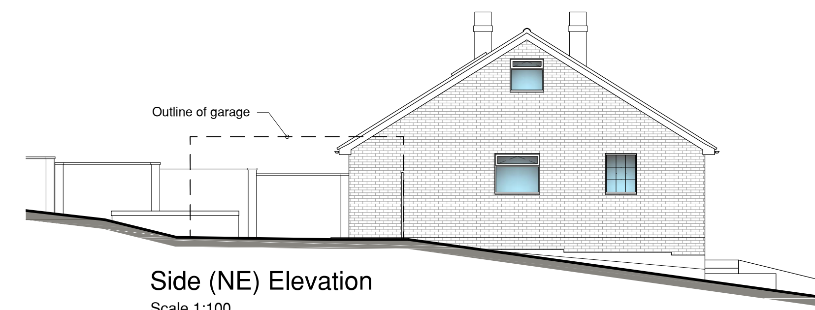
Side (NE) Elevation Scale 1:100