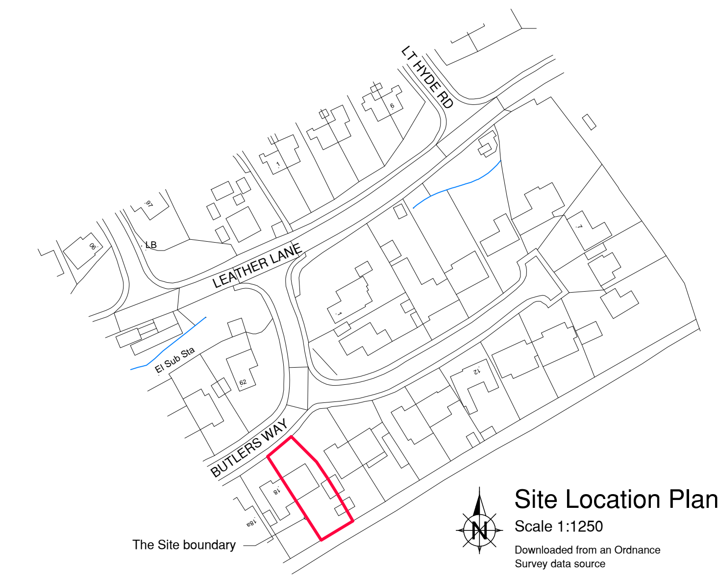
Site Location Plan Scale 1:1250 Downloaded from an Ordnance Survey data source