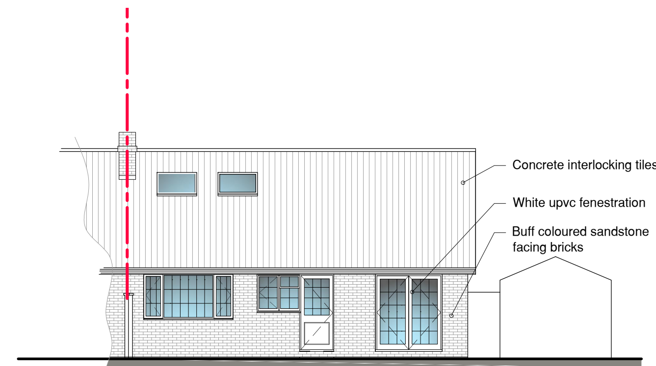
Rear (SE) Elevation Scale 1:100