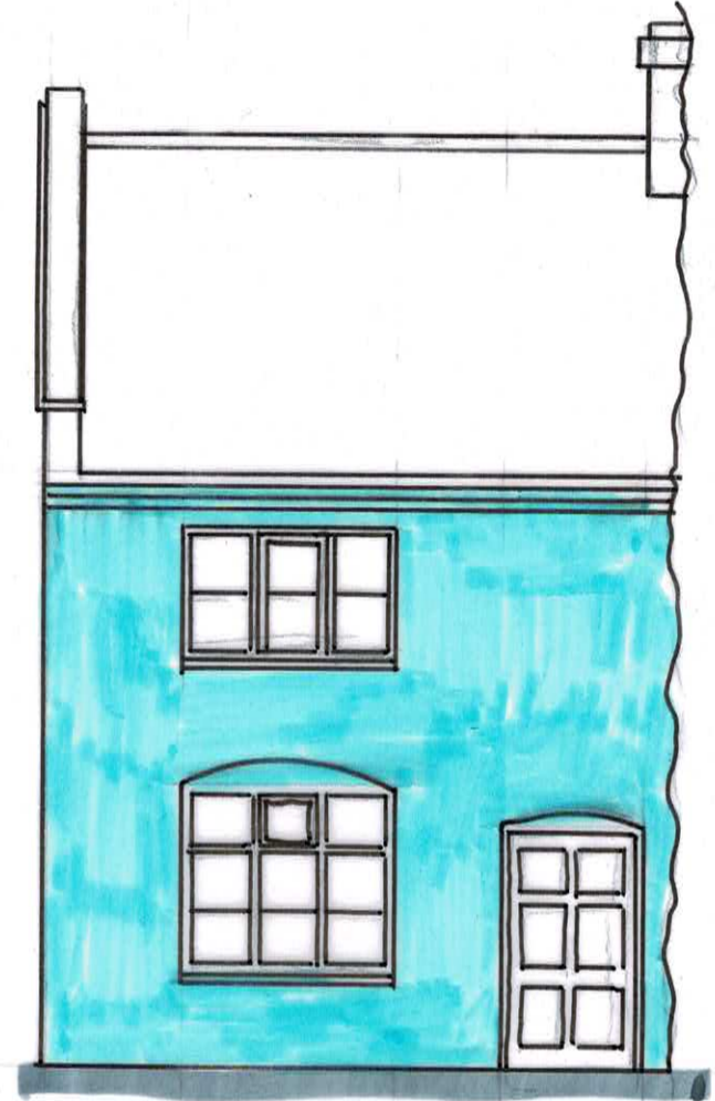
WEST ELEVATION 1:50