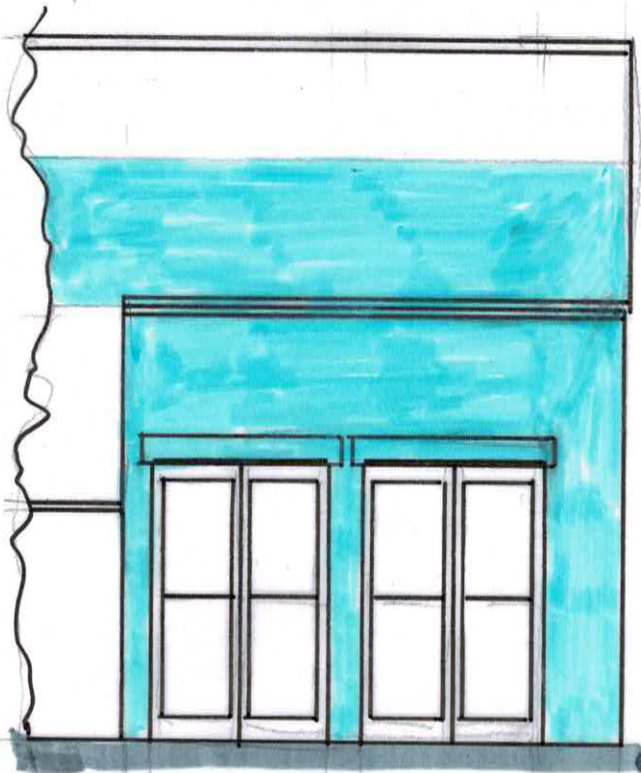
SOUTH ELEVATION 1:50

IT IS PROPOSED TO INSTALL INSULATED DRY LINING TO THE INTERNAL SURFACES OF THE AREAS COLOURED BLUE. SEE WRITTEN STATEMENT FOR FURTHER DETAILS.