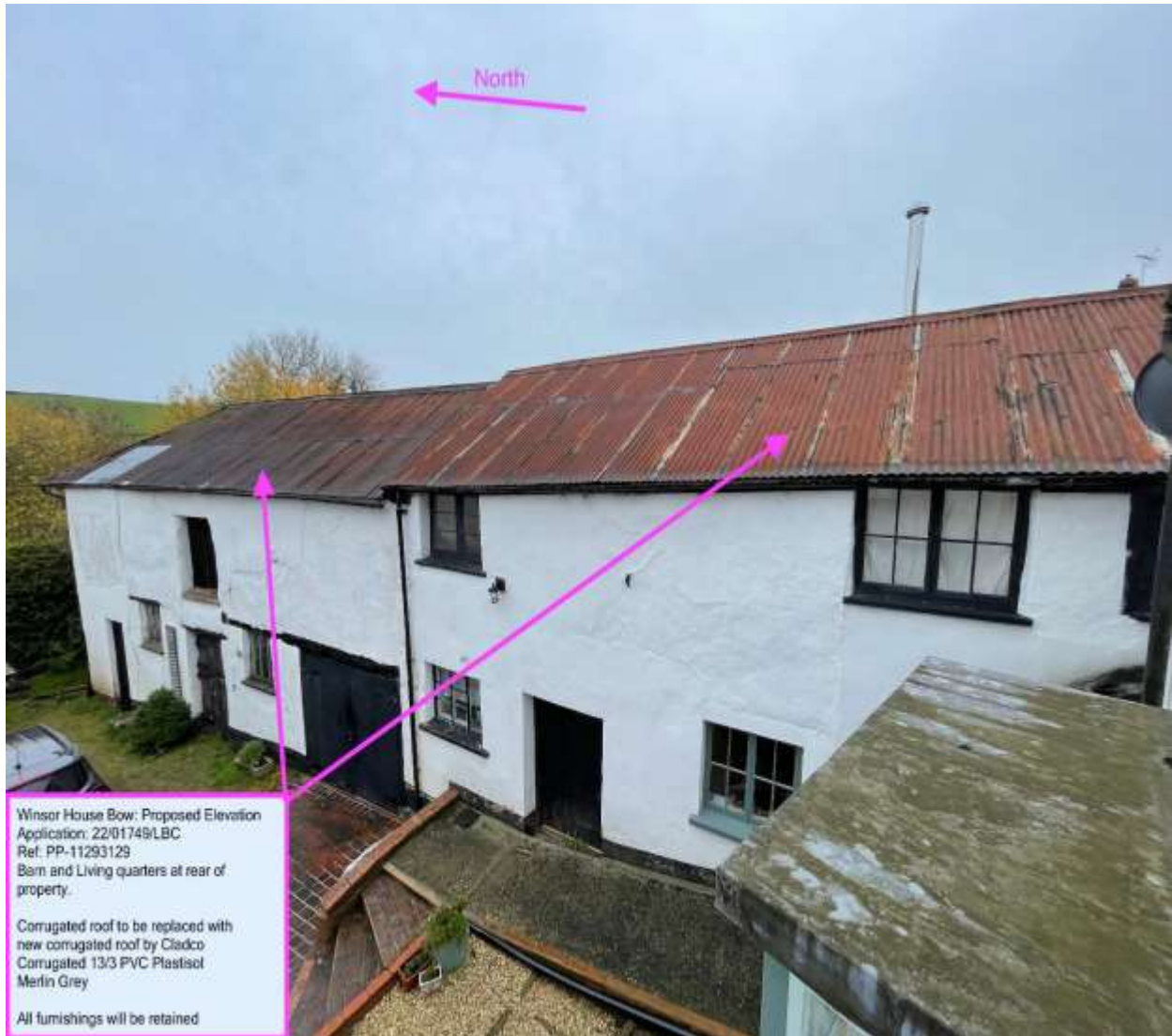
find attached picture 1 Winsor House - Barn Proposed.jpg - Side view of the barn showing existing roof with annotation to show proposed