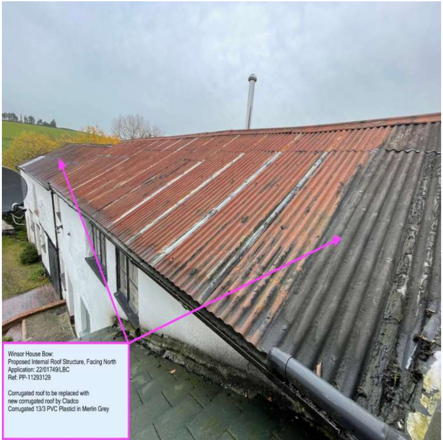
Please find attached picture 2 Winsor House - Barn North Facing Proposed Picture showing barn roof from the upstairs of the property with annotation to show proposed change