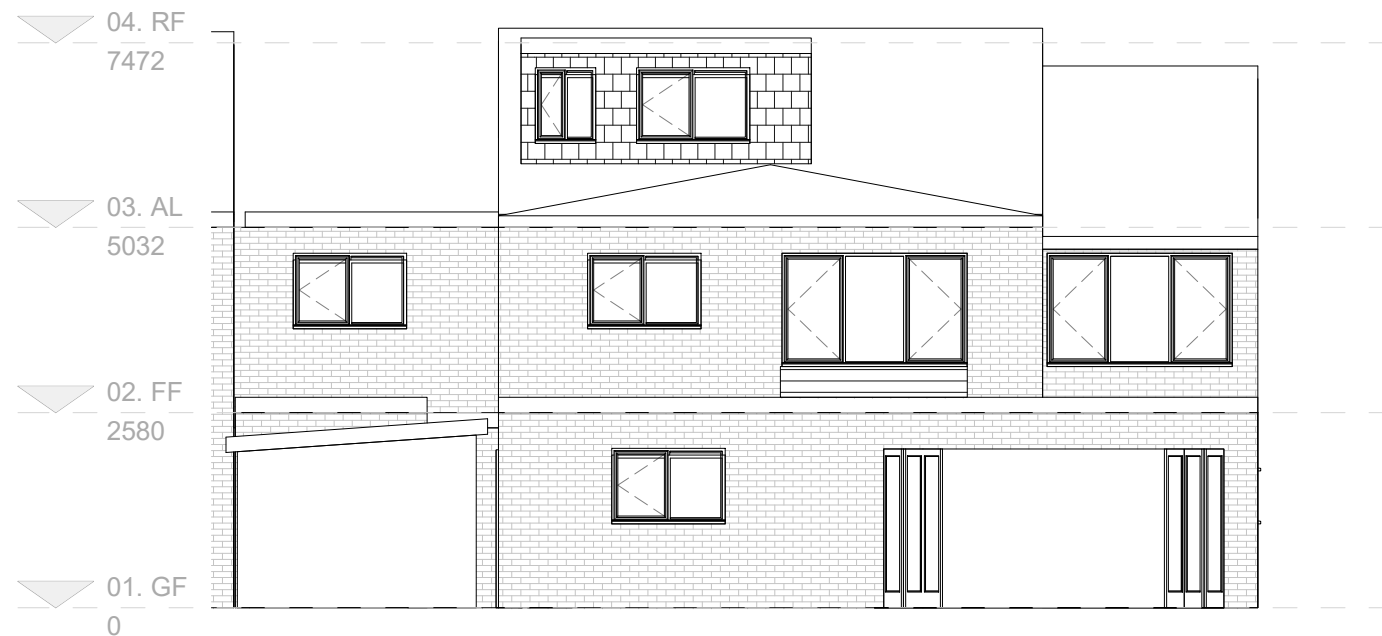
02. Rear Elevation Proposed 1 : 100