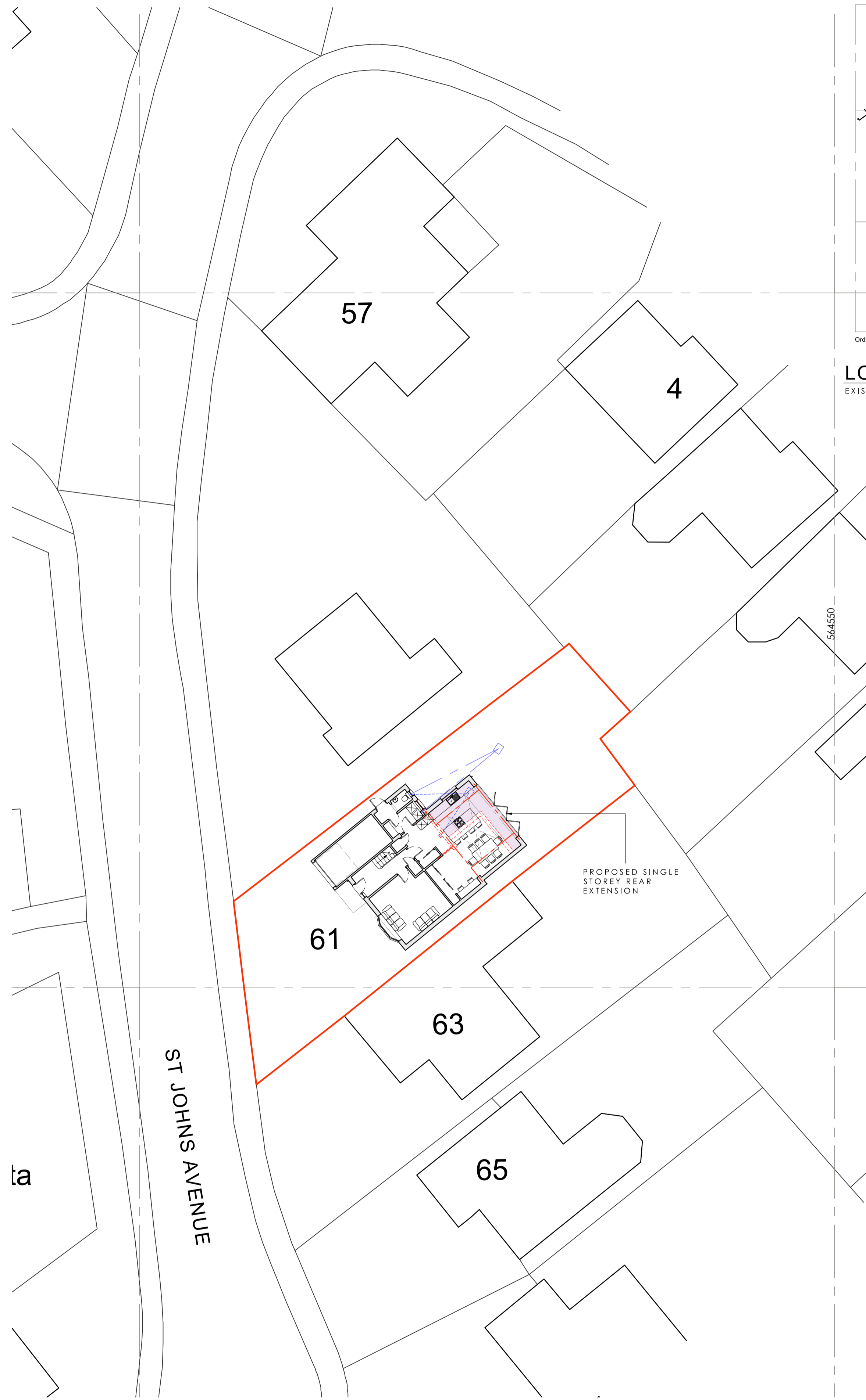
PROPOSED SITE PLAN PROPOSED 1:200 @ A1