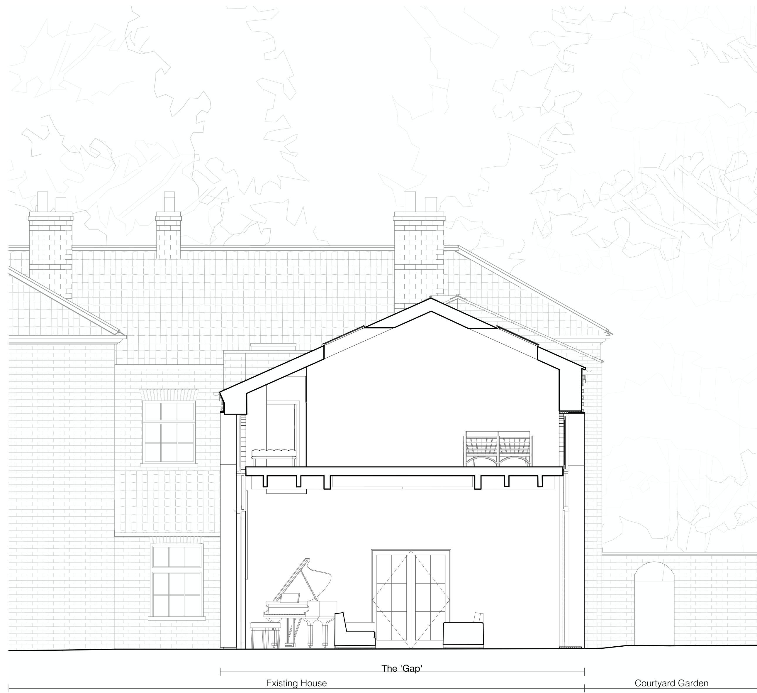
Section A-A (North Elevation)