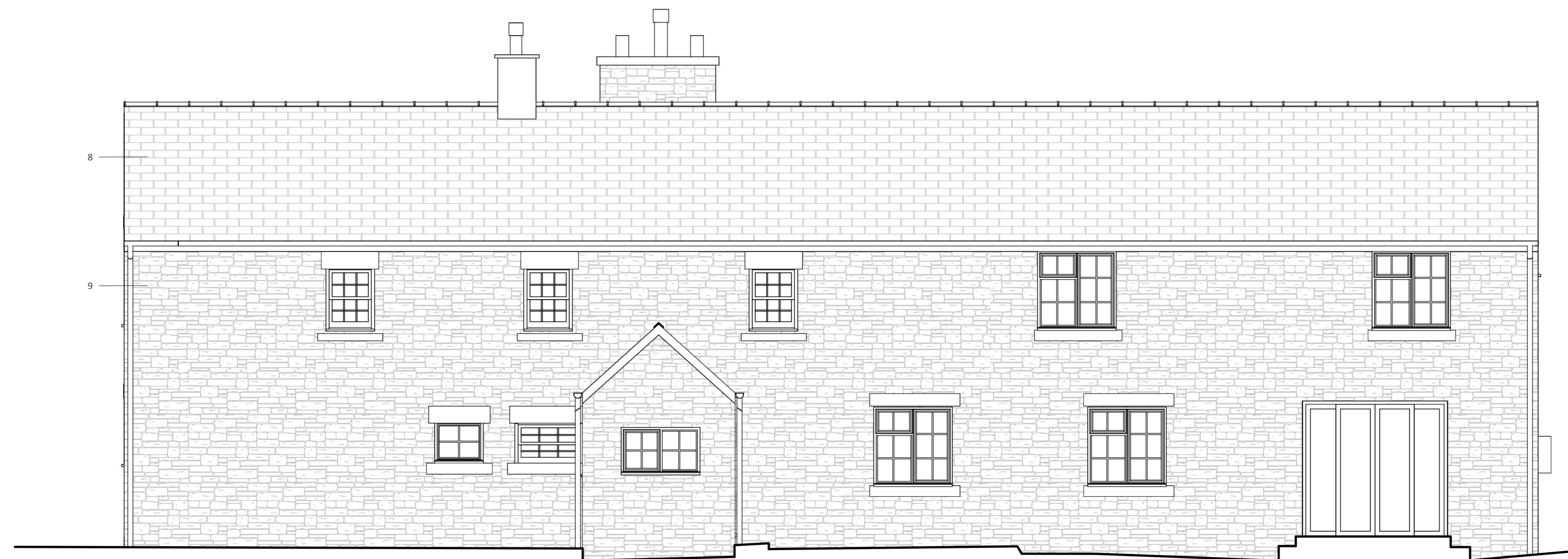
2 Existing South Elevation 1 : 50