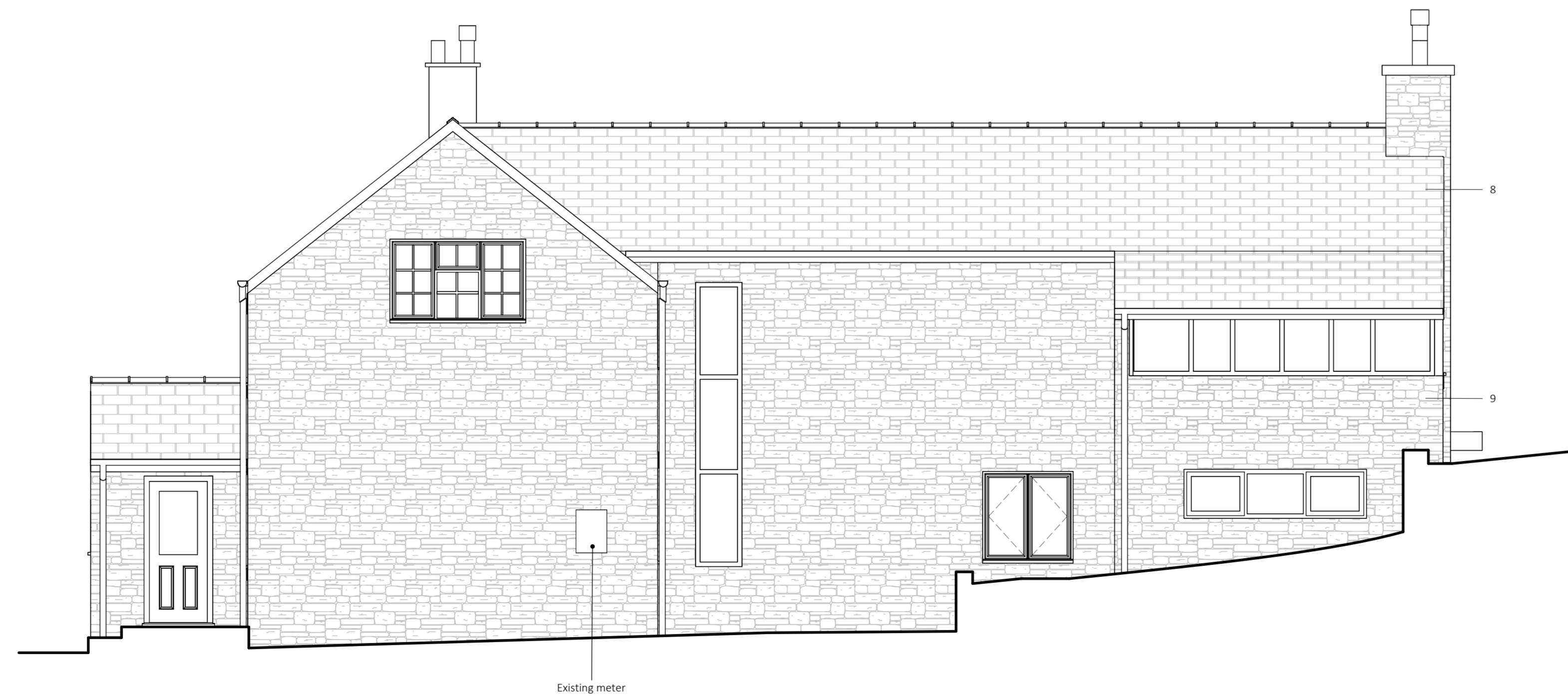
2 Existing East Elevation 1 : 50