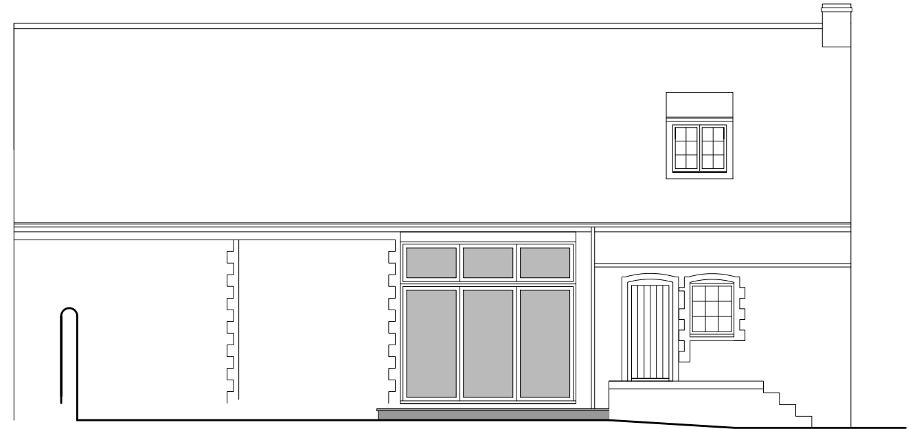
Outbuilding (South-West) - PROPOSED DOOR INFILL