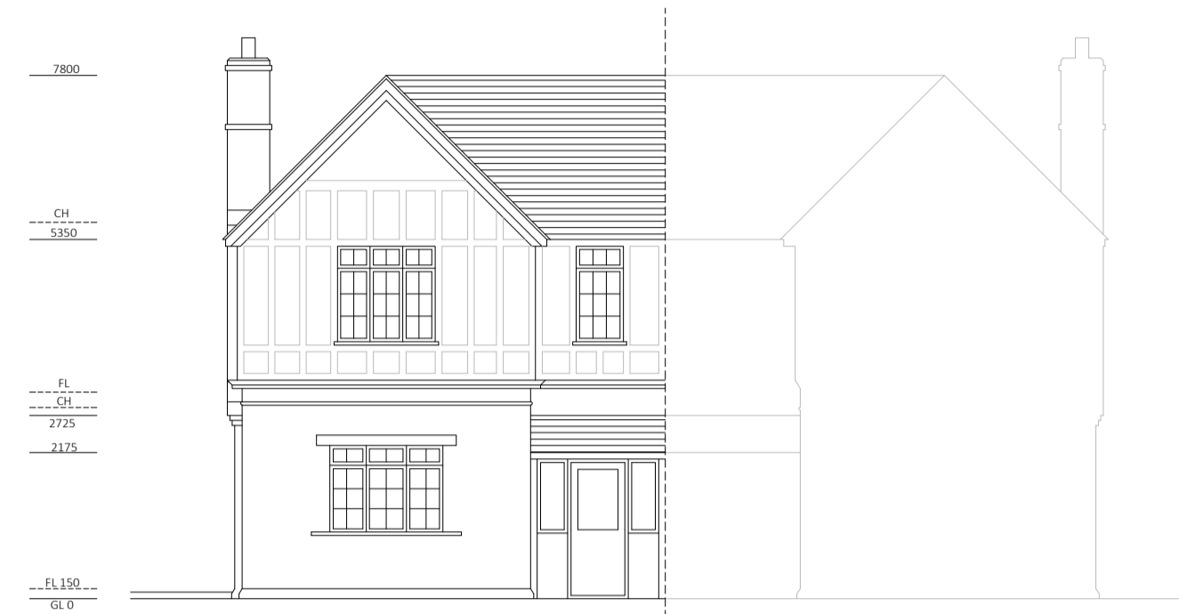
Front Elevation - Facing Huntingdon Rd