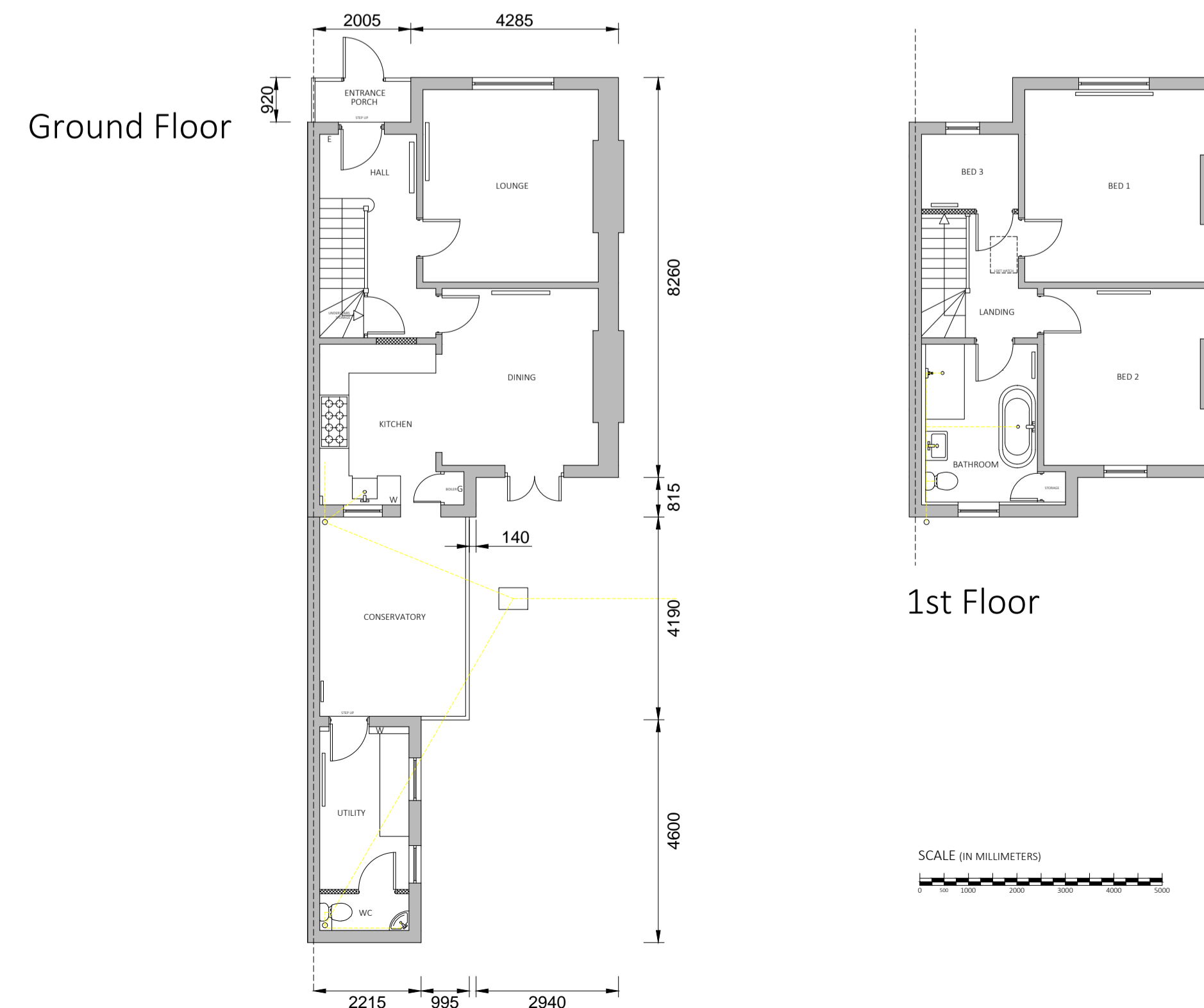
Existing Floor Plans 1:100