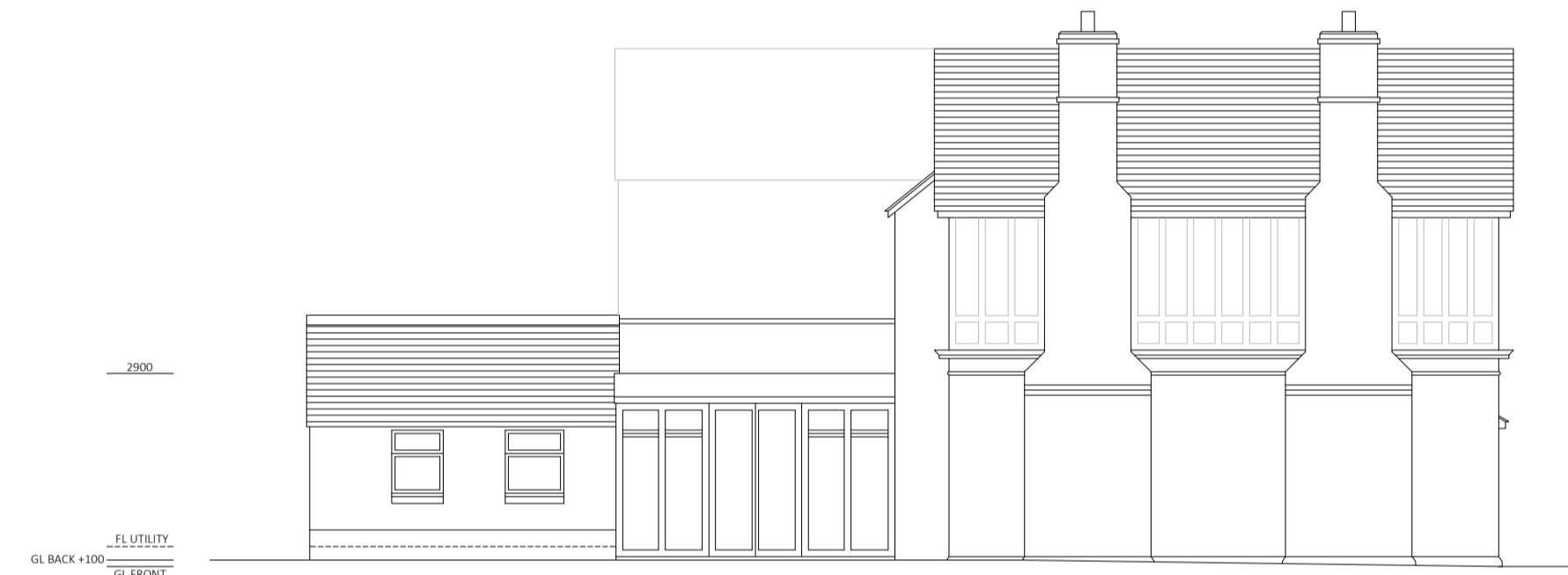
Side Elevation - Facing No. 145