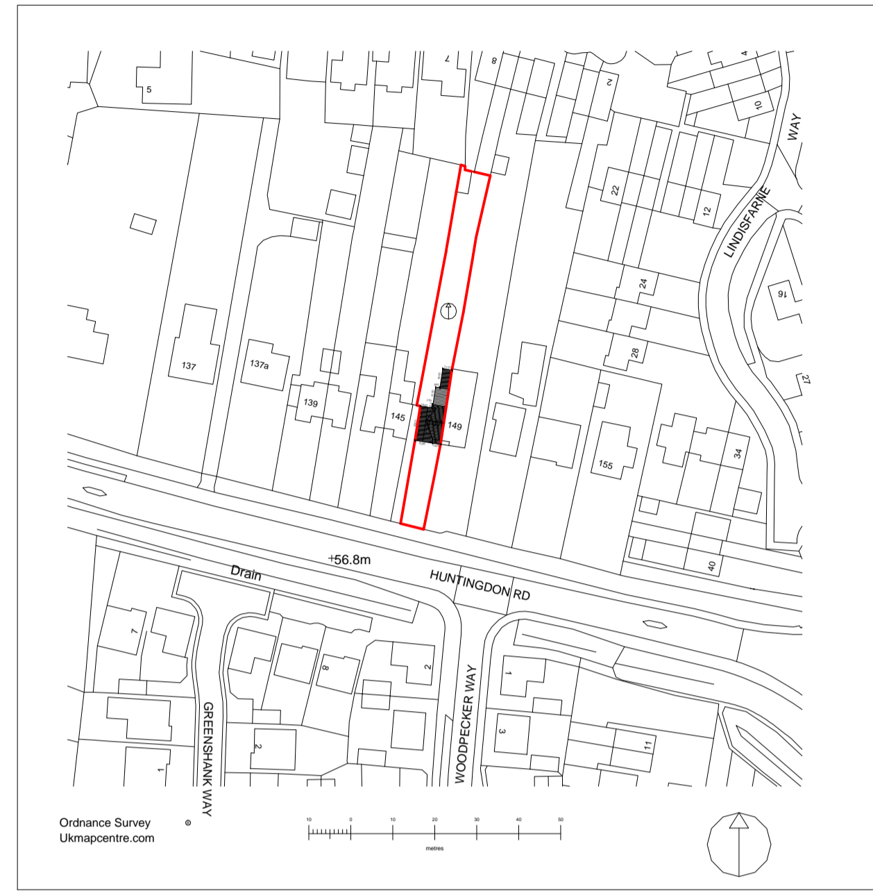
Existing Location Plan 1:1250