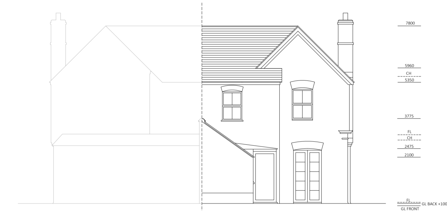
Rear Elevation - Garden