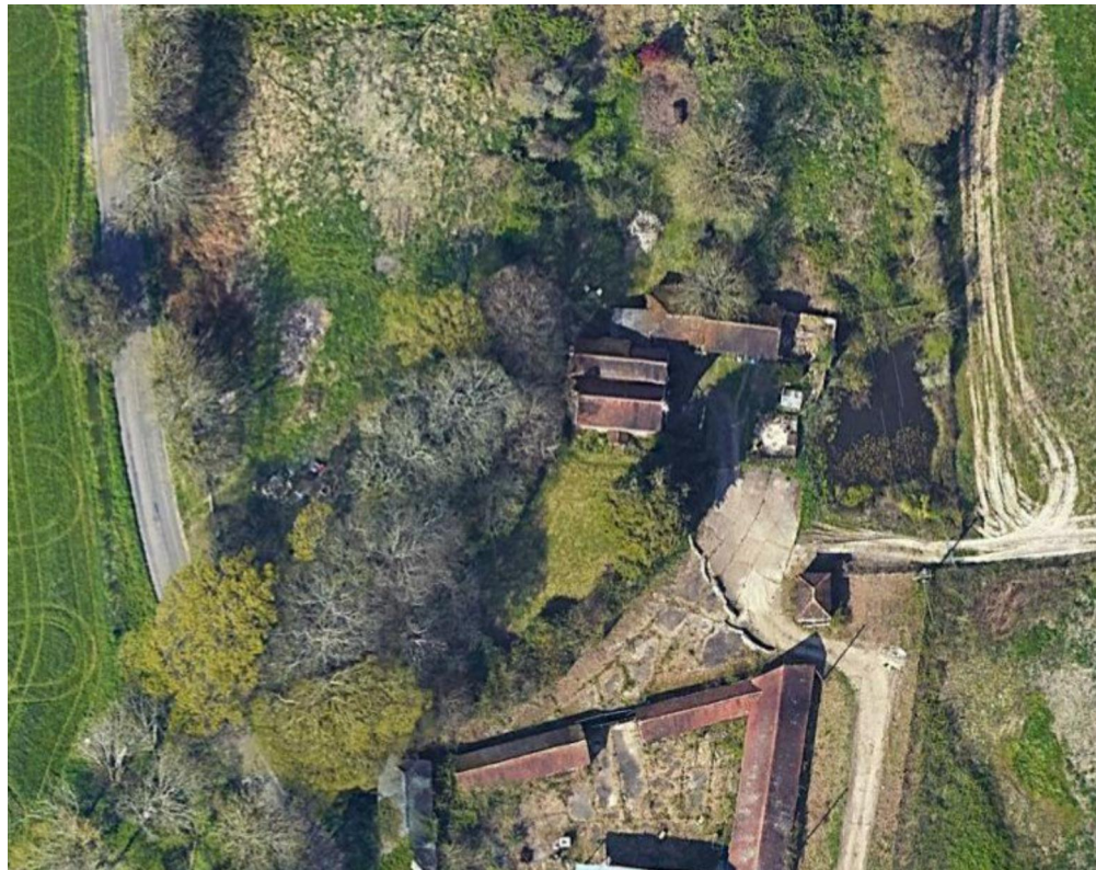
Aerial Photo (2020)