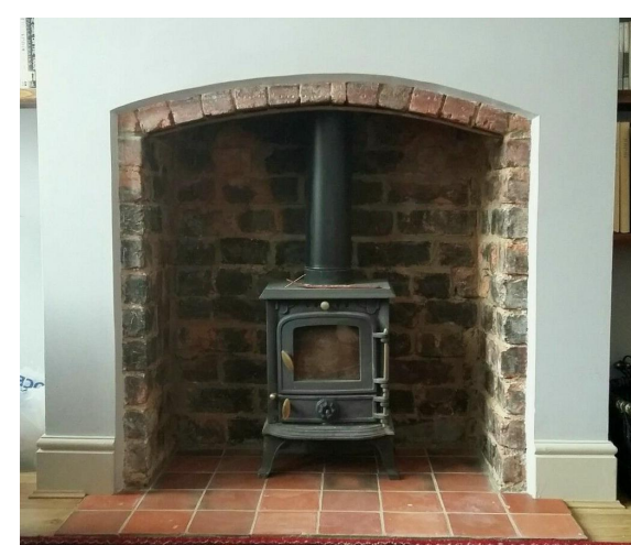
Fire surround NTS | PROPOSED