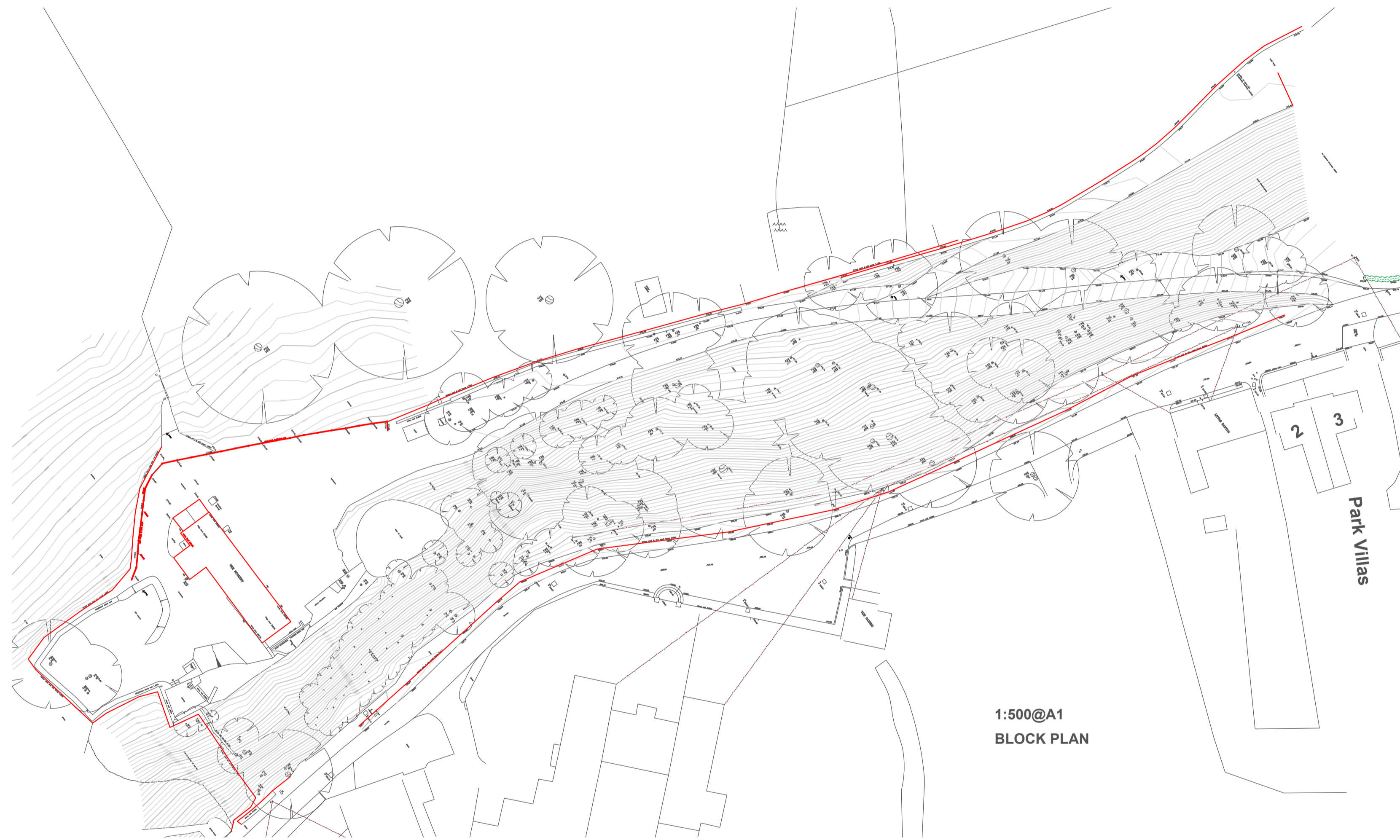
1:500@A1 BLOCK PLAN