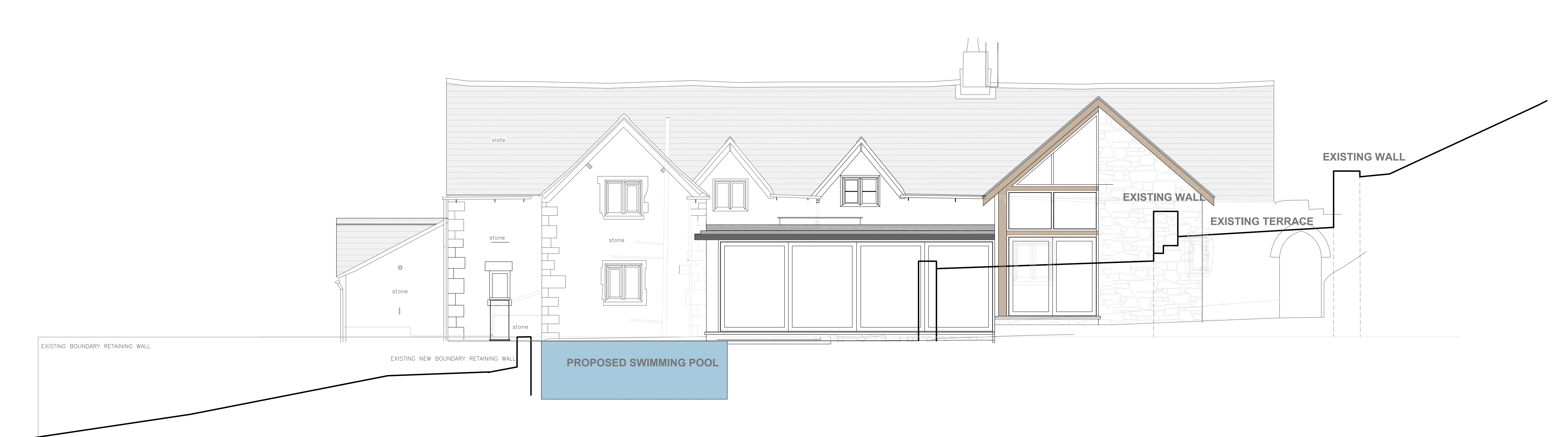
SECTION 1 TO 50 SCALE AS PROPOSED