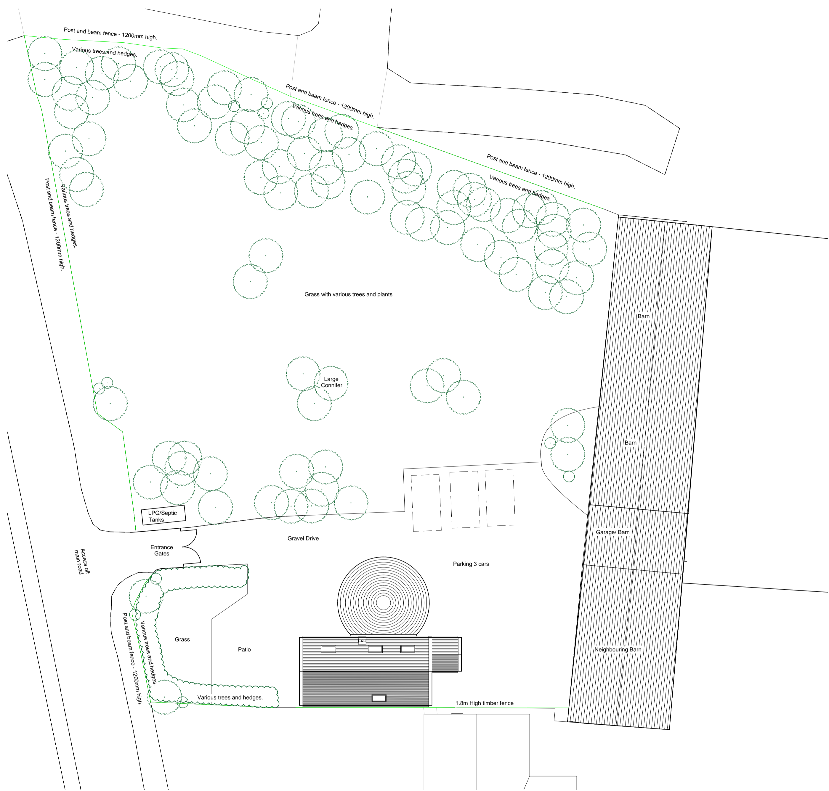
Existing Block Plan 1:200