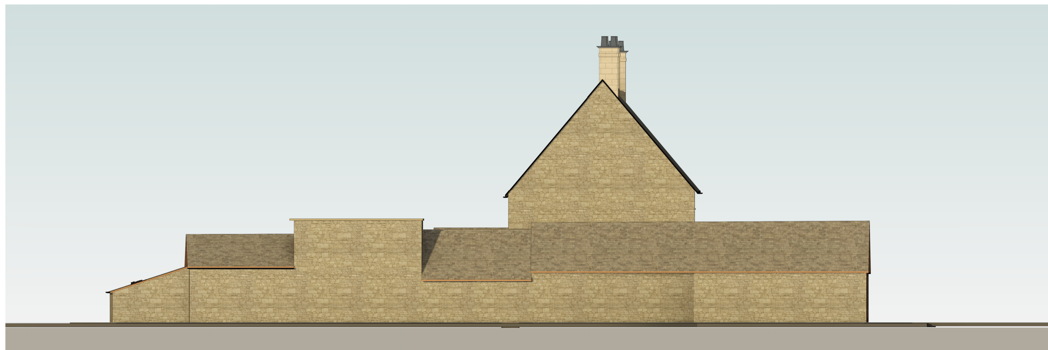
2 Rear Outbuilding Elevation CF 08 70 02 1:100