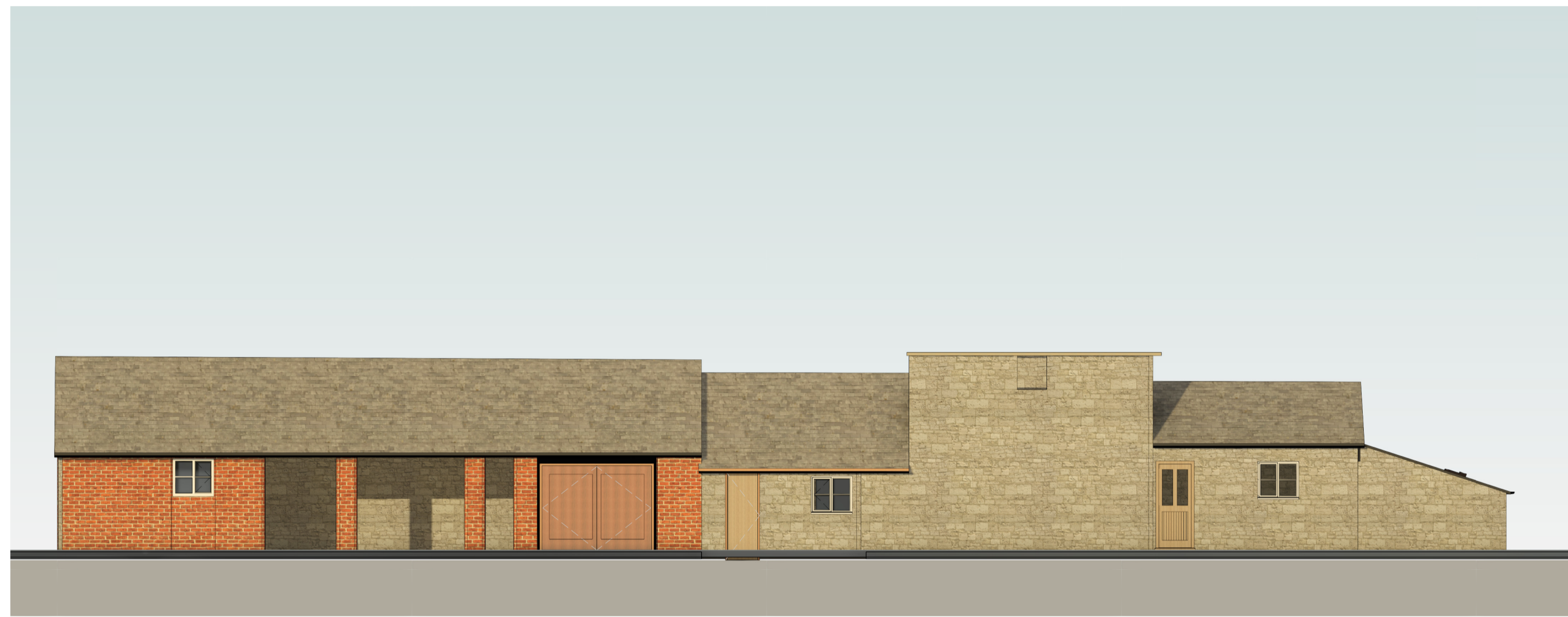
1 Outbuilding Front Elevations as Proposed CF 08 70 02 1:100