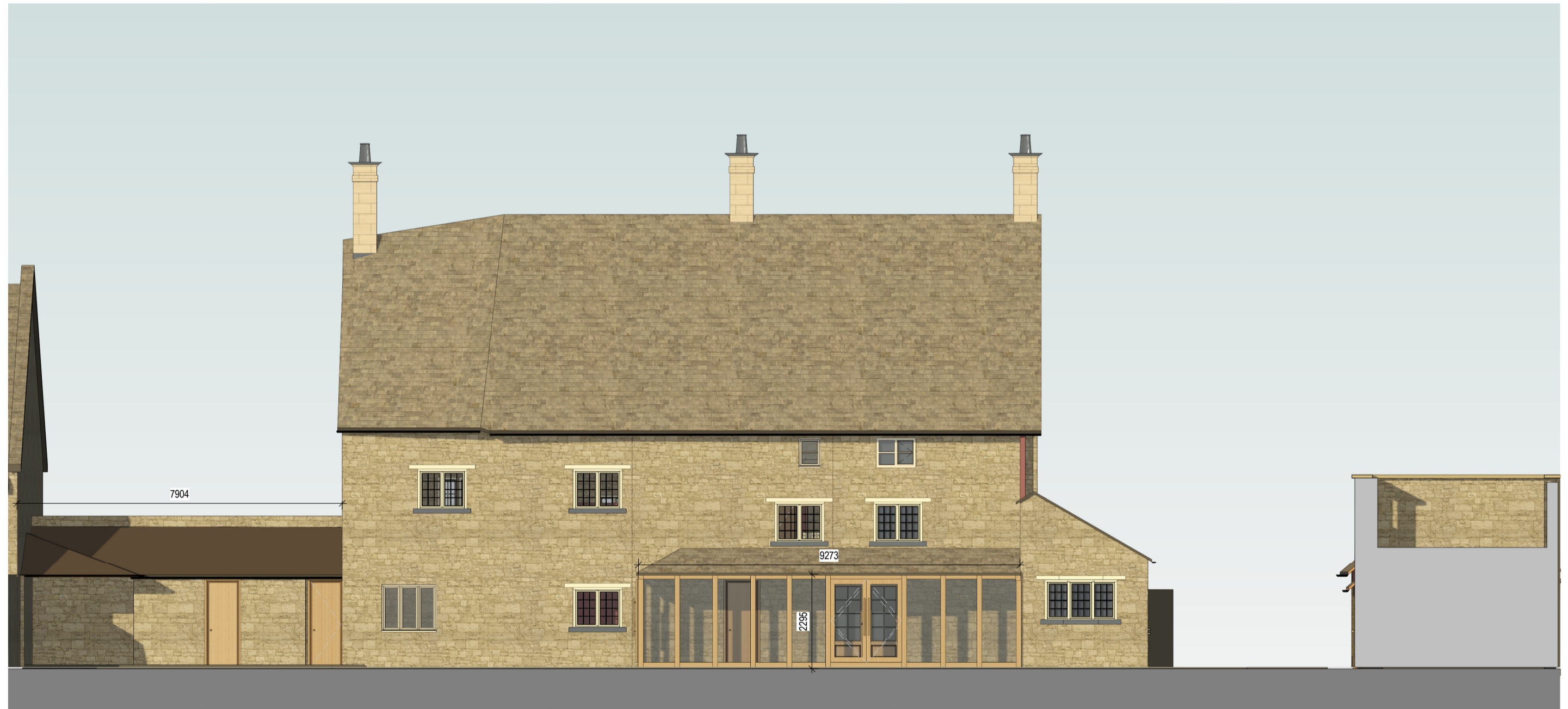
03 Rear Elevation CF 08 70 01 1:100