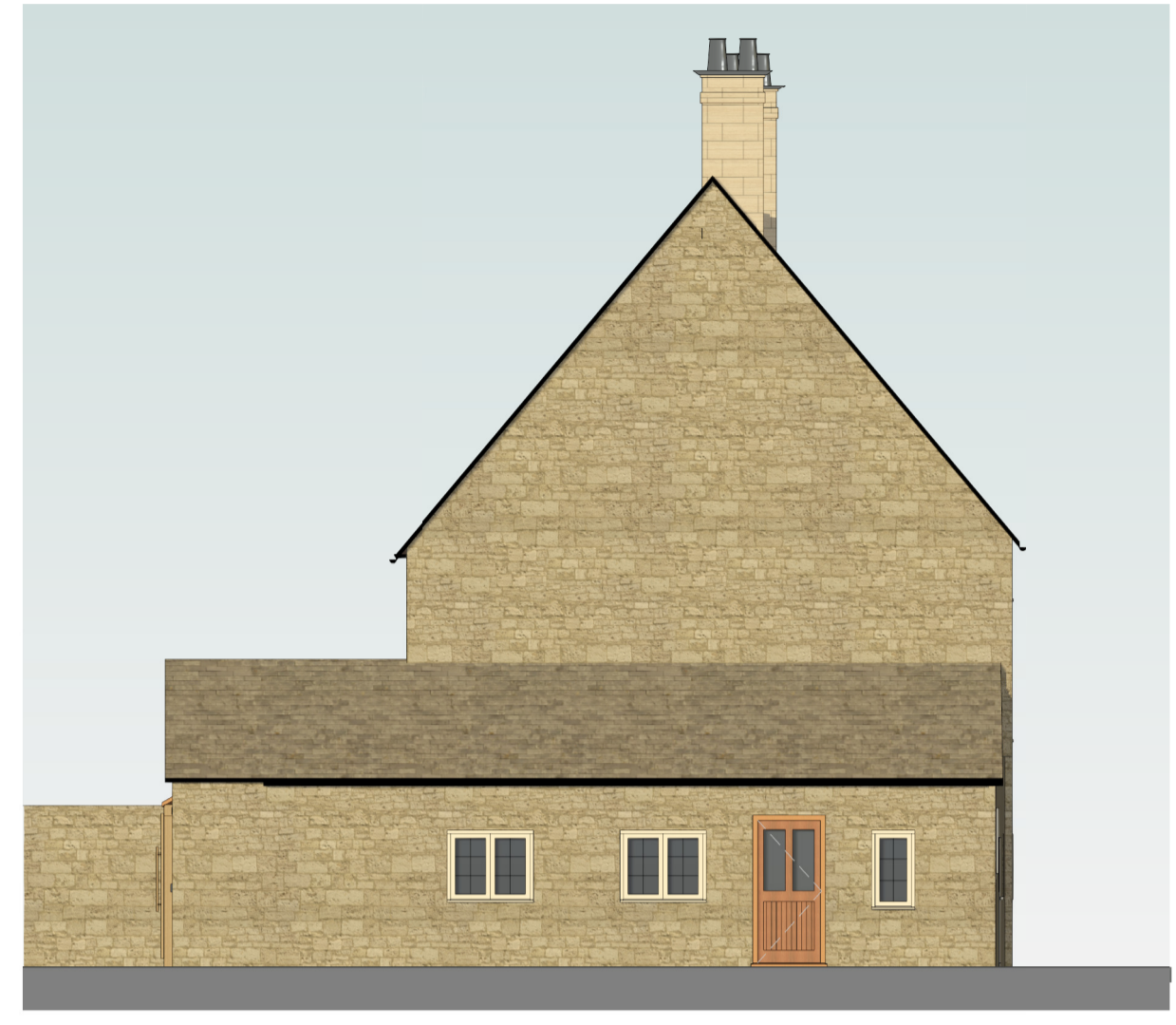
02 Side Elevation CF 08 70 01 1:100