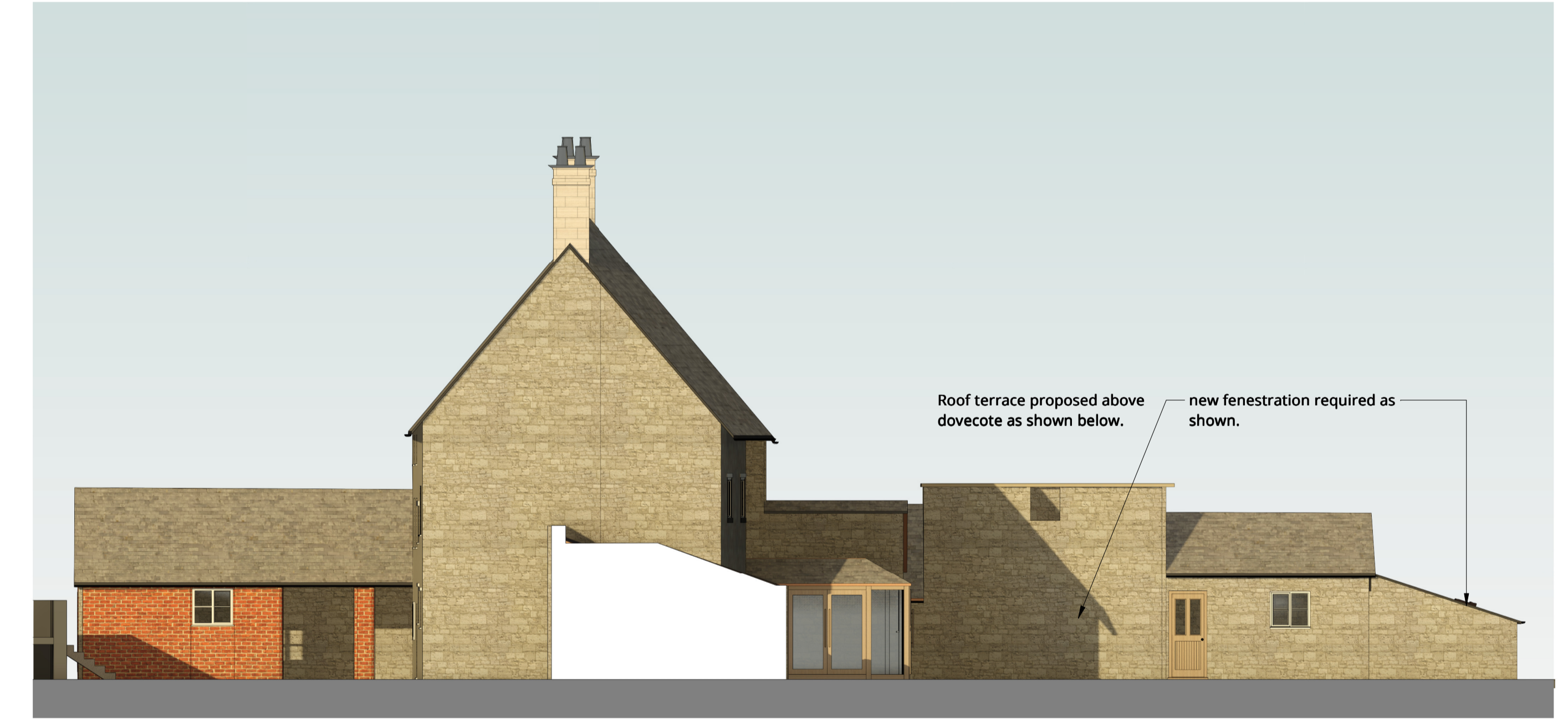
04 Side Elevation 2 CF 08 70 01 1:100