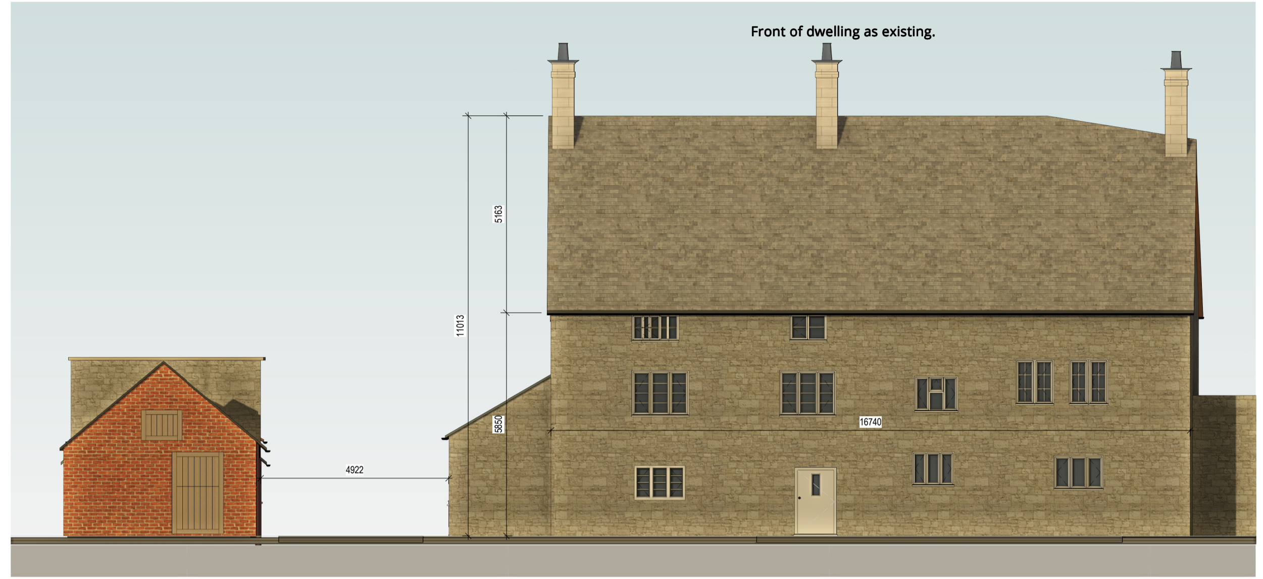
01 Front Elevation CF 08 70 01 1:100