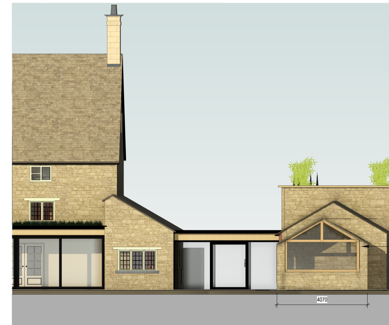
3 End Elevation of Outbuilding as Proposed CF 08 70 04 1:100