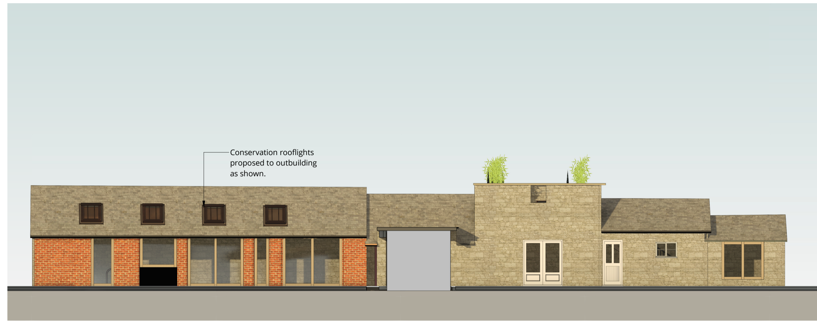
1 Outbuilding Front Elevations as Proposed CF 08 70 04 1:100