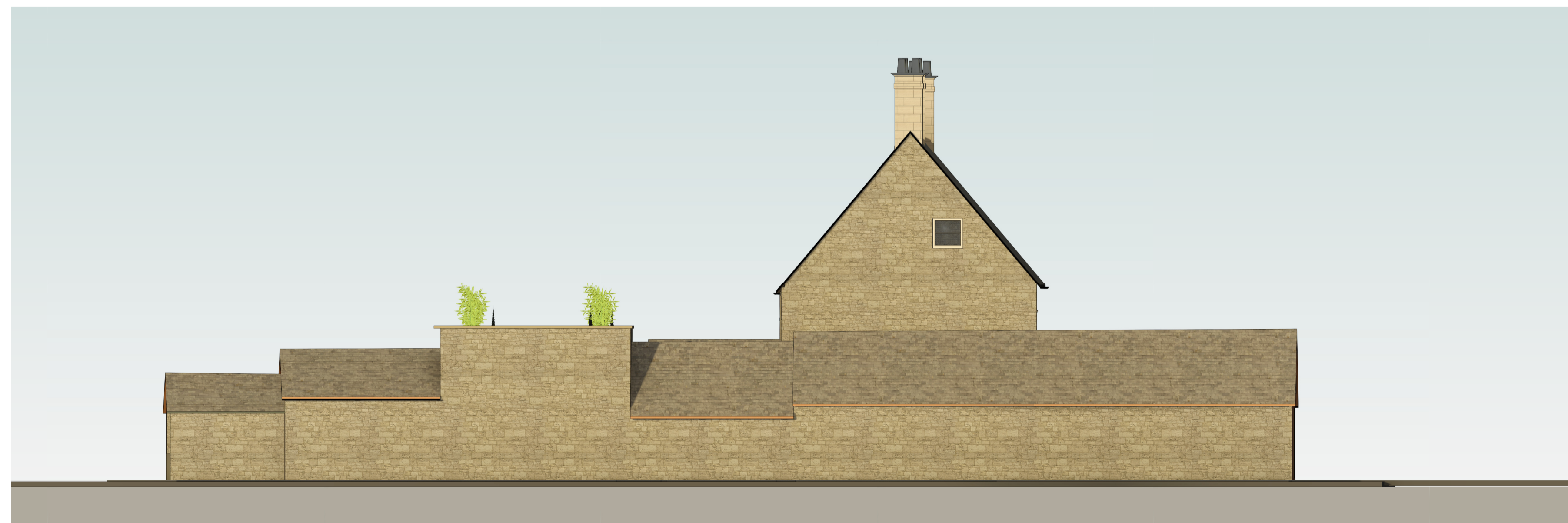
2 Rear Outbuilding Elevation CF 08 70 04 1:100