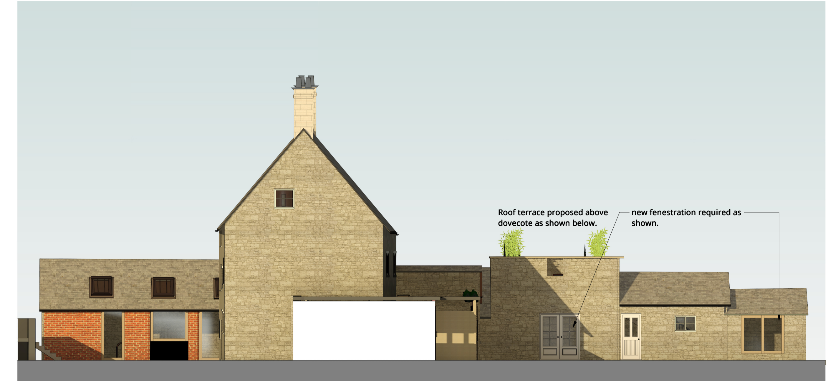
04 Side Elevation 2 CF 08 70 03 1:100