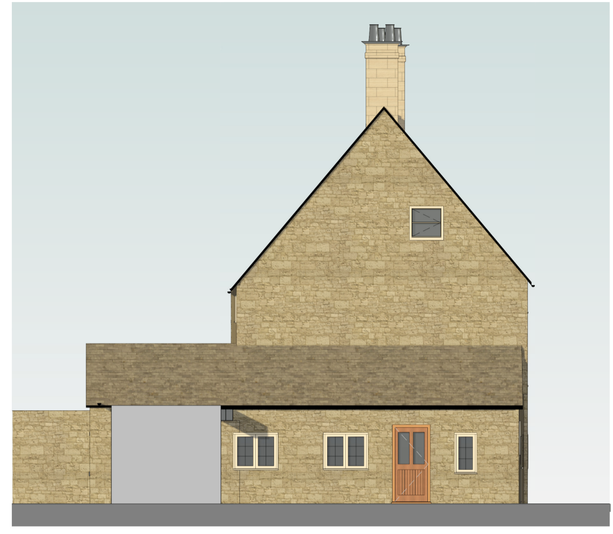
02 Side Elevation CF 08 70 03 1:100