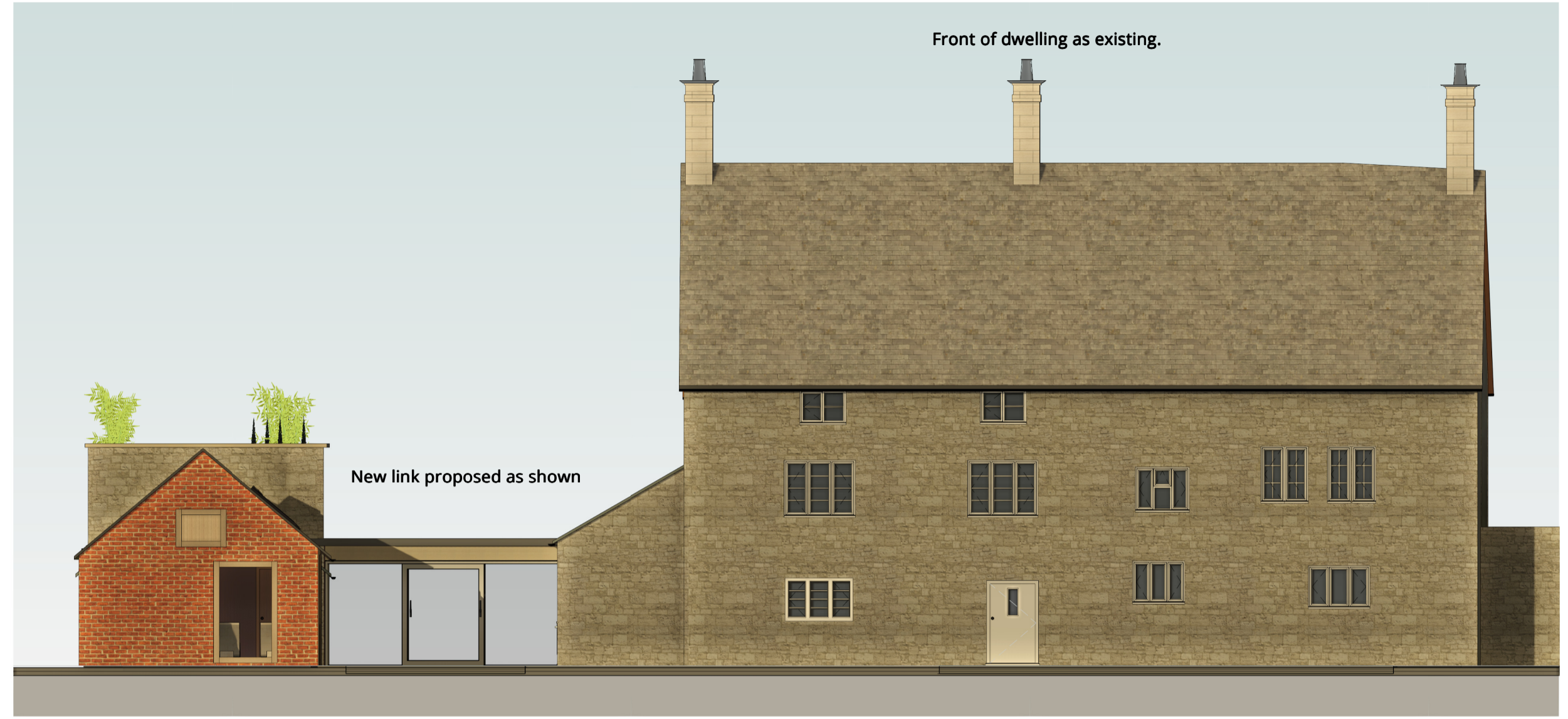
01 Front Elevation CF 08 70 03 1:100