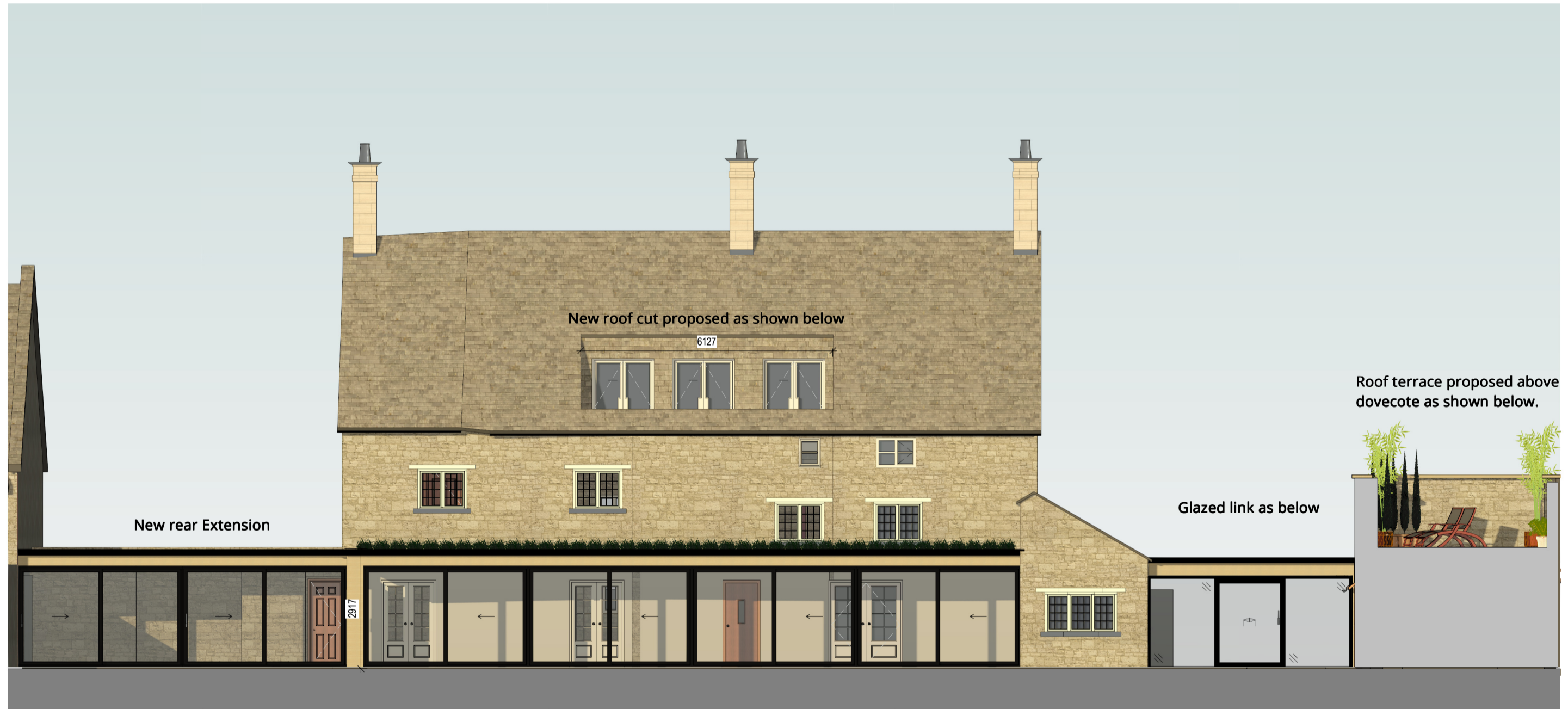
03 Rear Elevation CF 08 70 03 1:100