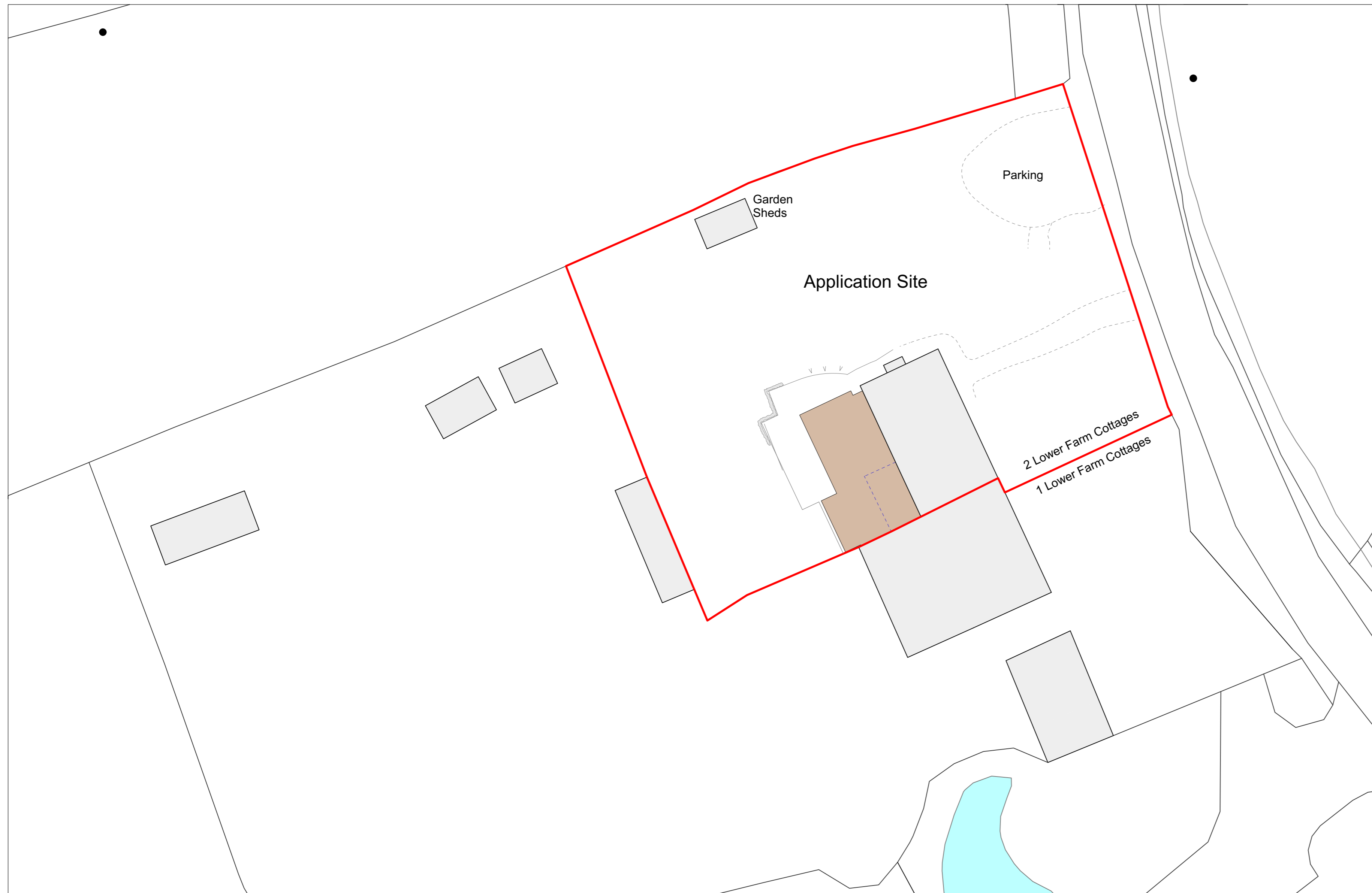
Proposed Site/Block Plan Scale 1:200 @ A1