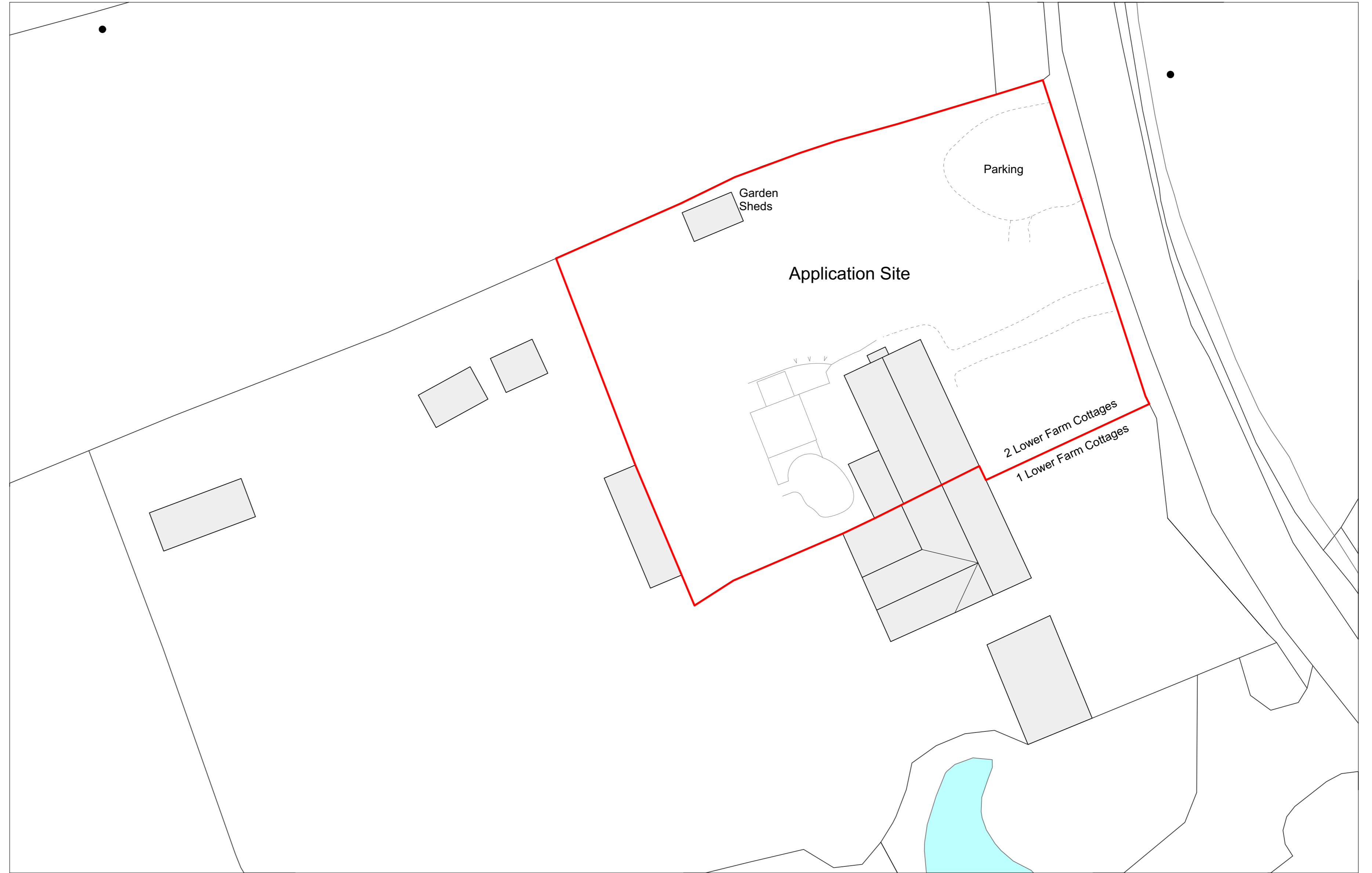
Existing Site/Block Plan Scale 1:200 @ A1