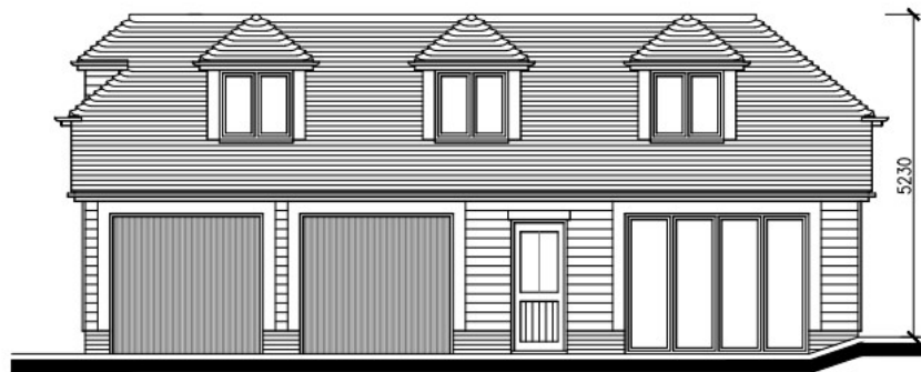
Fig. 1 – Originally submitted Proposed Southwest Elevation, which was considered "overly domestic" by the case officer

The applicants would like to make a minor change to the approved outbuilding to remove the rooflights on the south west elevation and incorporate two small dormers in lieu of the larger triangular dormer.