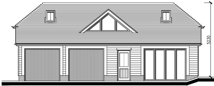
Fig. 2 – Extant consent South West Elevation