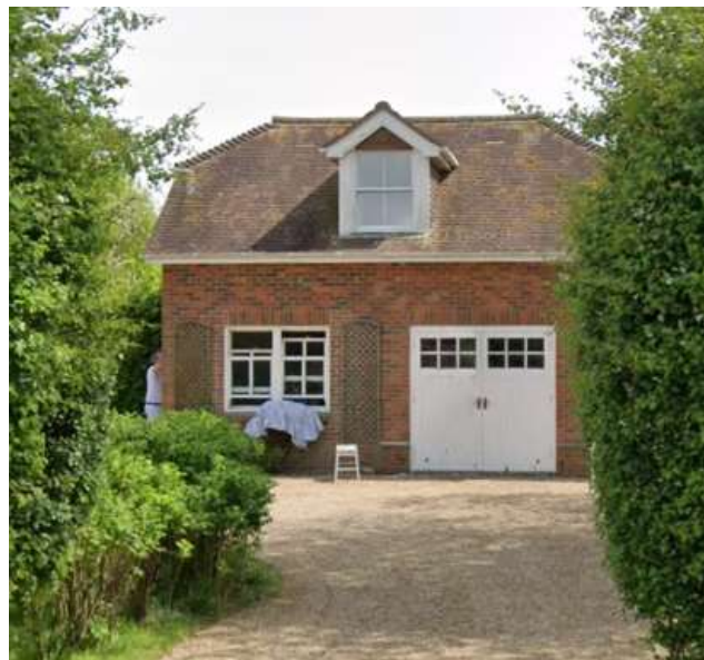
Fig 6: Outbuilding at West View, Trinity Road. The dormer window and hipped roof form are similar in character to the proposed amended elevation above.

The proposal is still appropriate to its setting in terms of scale, height and massing. It is no higher than the extant consent and uses the same material pallet. The amended proposal complements the attractive nature of the surrounding environment with no impact on the amenity of the neighbouring property to the south. The proposal is not overly domestic in appearance as the main roof slope remains the dominant feature of the outbuilding. The amended design also contributes to local distinctiveness and sense of place. It should be noted that the neighbouring property at West View, to the south of the application site, has a similar dormer window and roof form above the garage, as seen below. The amended proposal therefore complies with policies CP27 and CP29.