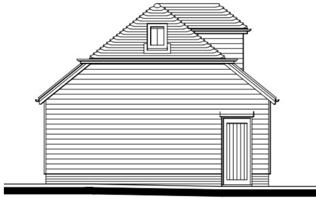
Fig. 5 – Proposed North West Elevation

The proposal is still appropriate to its setting in terms of scale, height and massing. It is no higher than the extant consent and uses the same material pallet. The amended proposal complements the attractive nature of the surrounding environment with no impact on the amenity of the neighbouring property to the south. The proposal is not overly domestic in appearance as the main roof slope remains the dominant feature of the outbuilding. The amended design also contributes to local distinctiveness and sense of place. It should be noted that the neighbouring property at West View, to the south of the application site, has a similar dormer window and roof form above the garage, as seen below. The amended proposal therefore complies with policies CP27 and CP29.