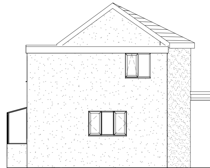
Side Elevation Existing