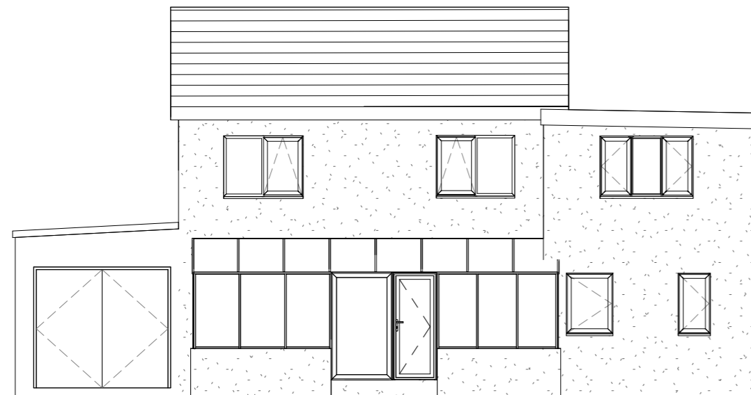
Front Elevation Existing