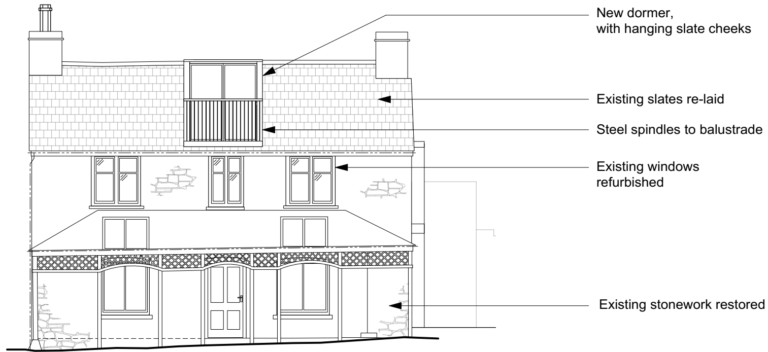
1 FRONT (SOUTH WEST) ELEVATION 121 1:100