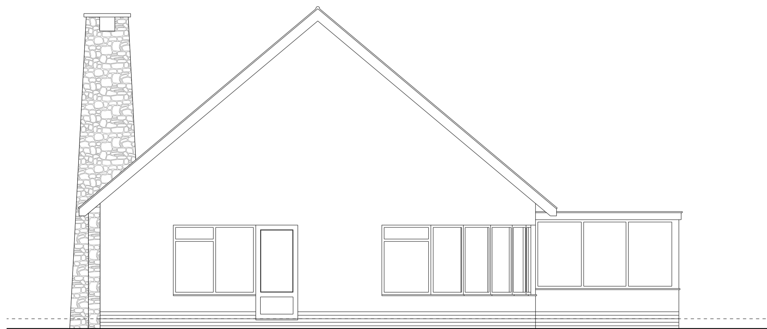
Existing south west elevation (side)