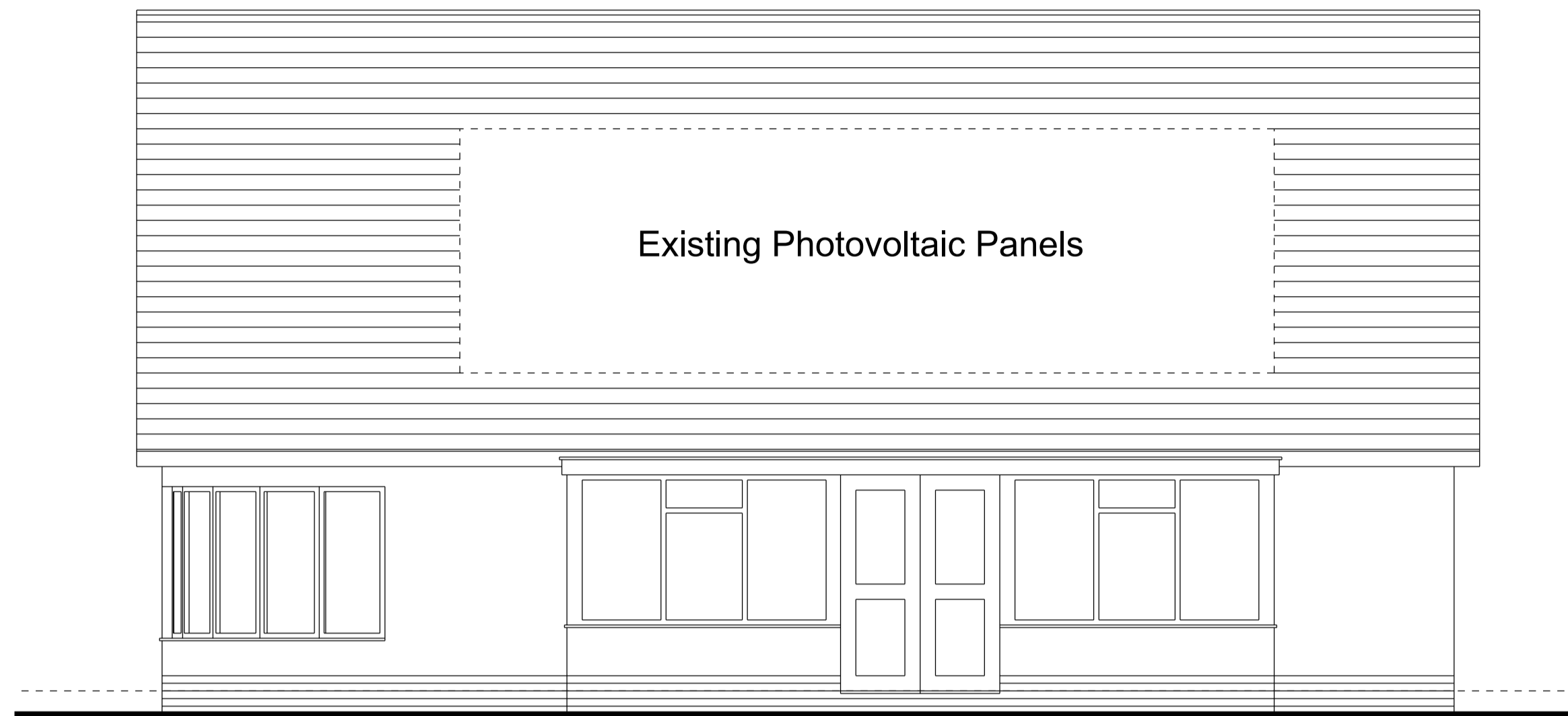
Existing north west elevation (front)