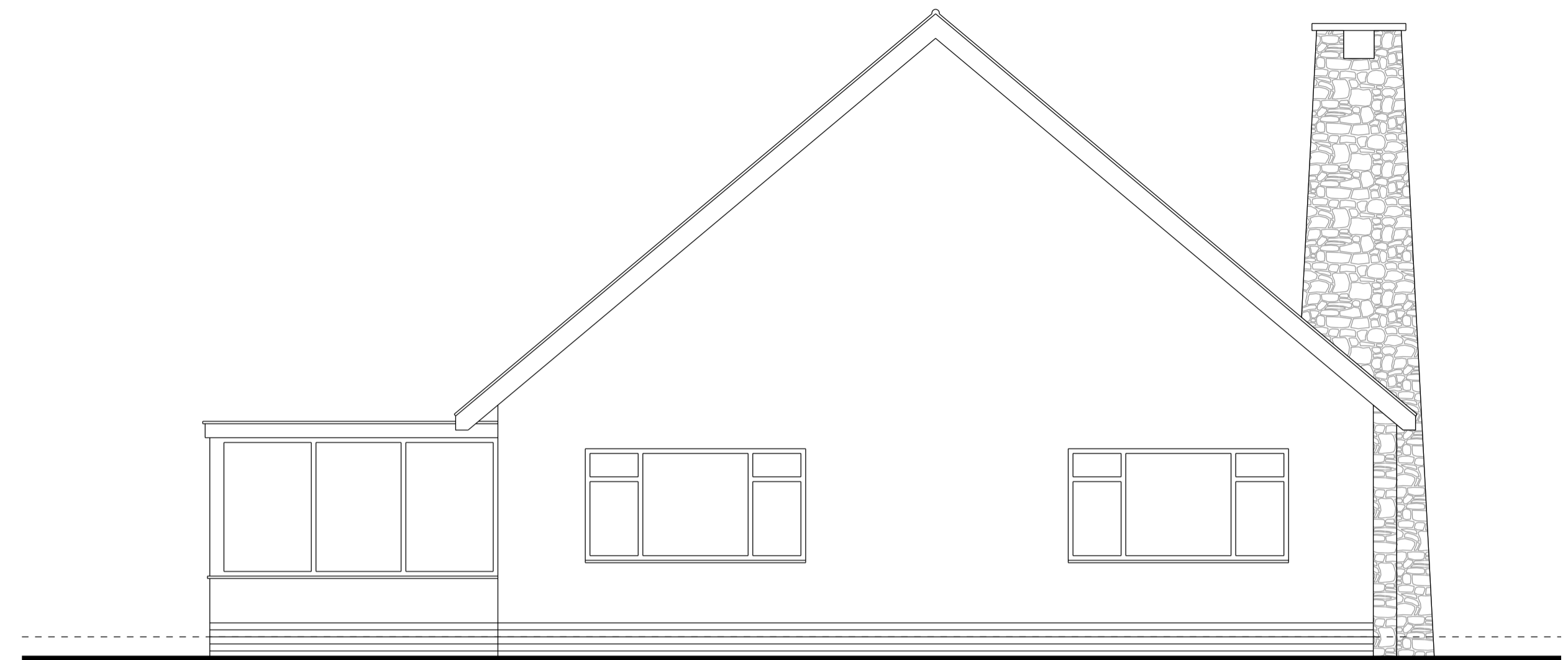
Existing north east elevation (side)