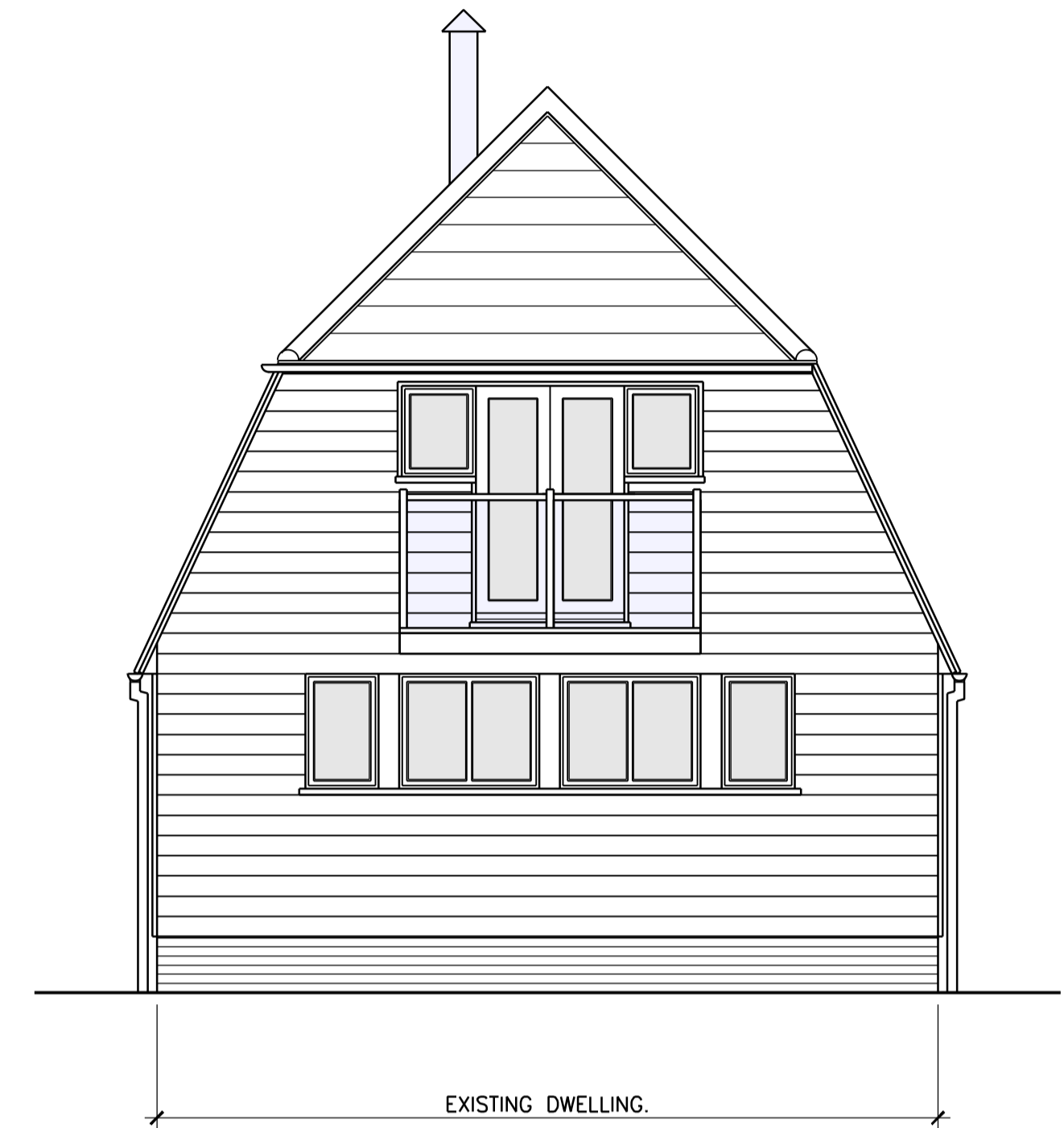
EXISTING SIDE ELEVATION SCALE 1:50