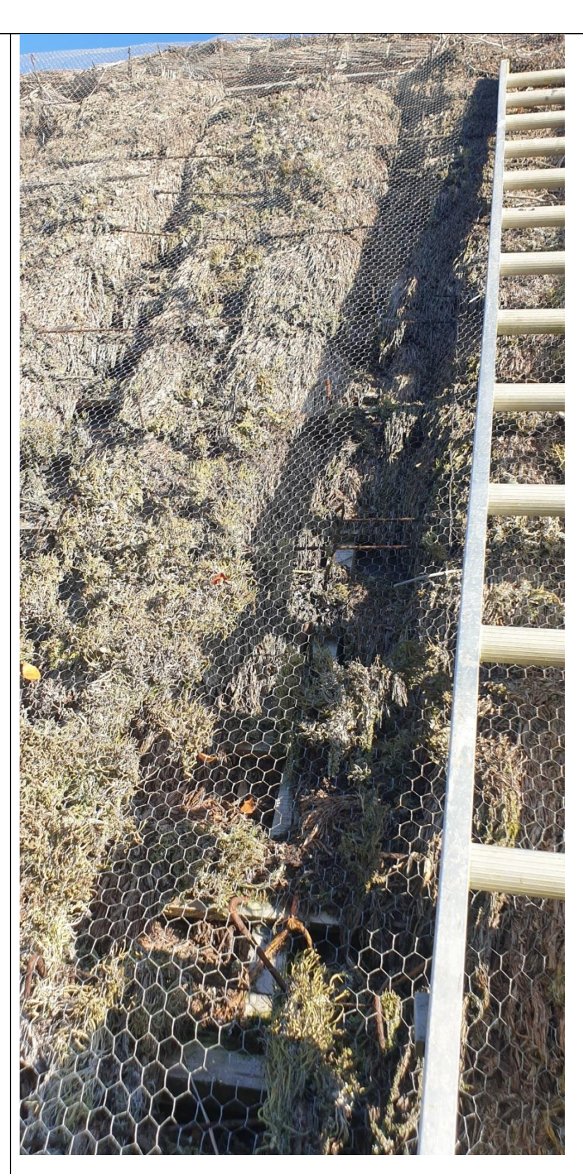
REAR THATCH and DETAIL