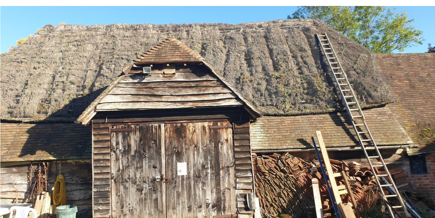
FRONT NORTH VIEW FROM LANE (Burnside to right)