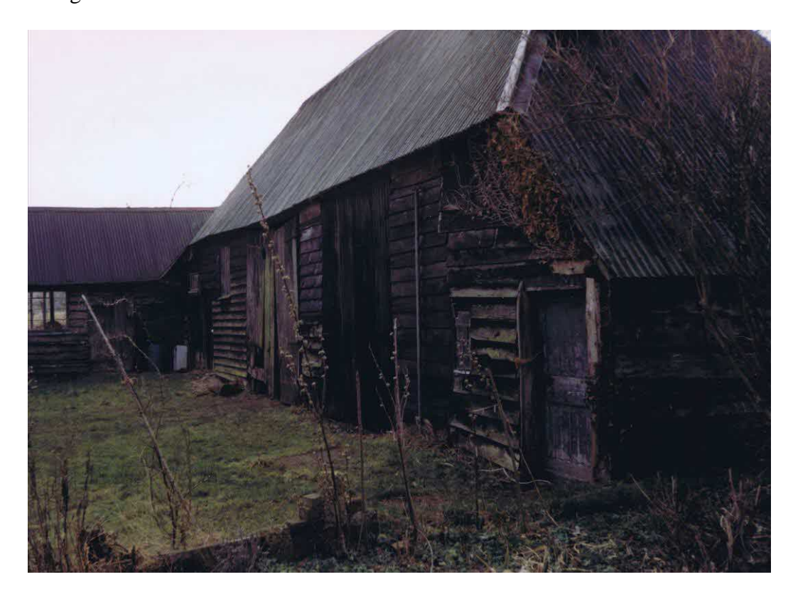
BARN IN 1990 and as LISTED

Whatever happens to the roof the rotten thatch needs removing and fixing holes repaired. The original corrugated iron roof is still in place below the thatch. This was retained for rigidity, not to disturb the original timbers and as a short term fire barrier. The barn was listed with this iron roof.