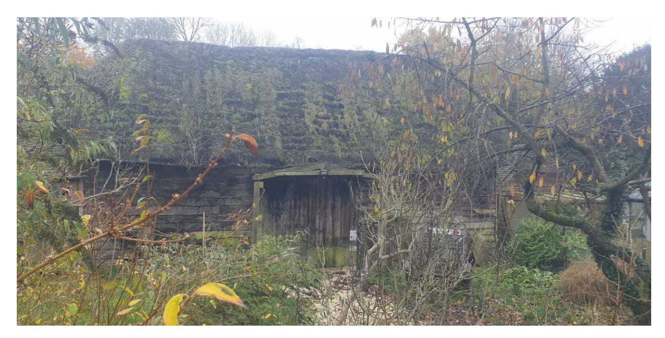
Brief Design Statement for Removal of Thatch To Mill Barn, Mill Lane, RG20 4UD