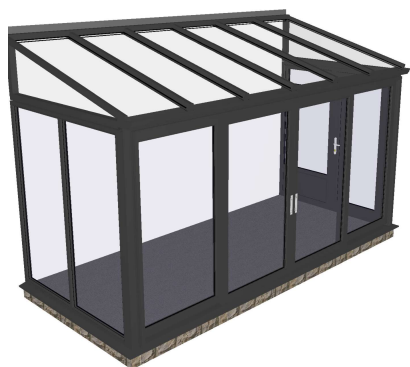
LEFT 3D VIEW