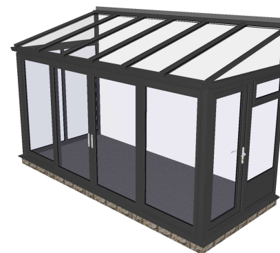
RIGHT 3D VIEW