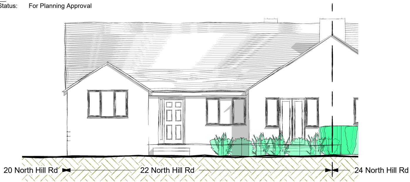
1 PL05 PL North Elevation - As Existing 1 : 100