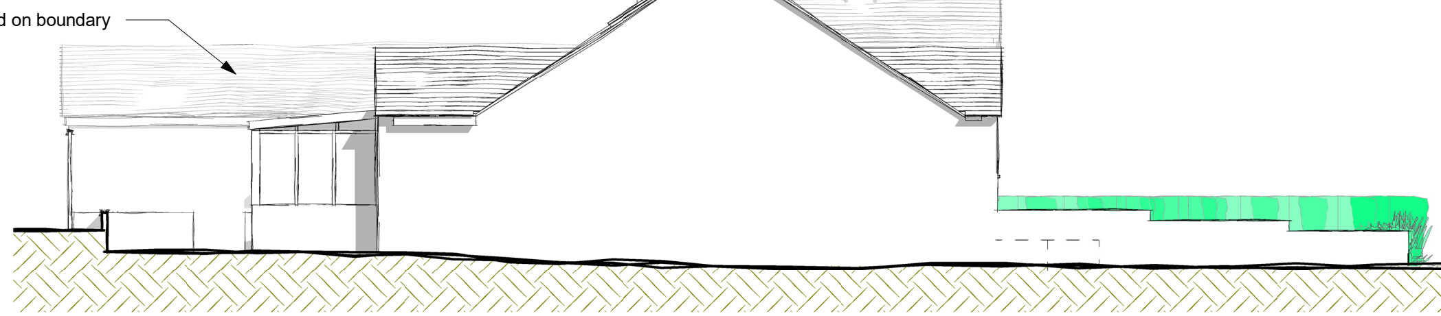
3 PL05 PL East Elevation - As Existing 1 : 100