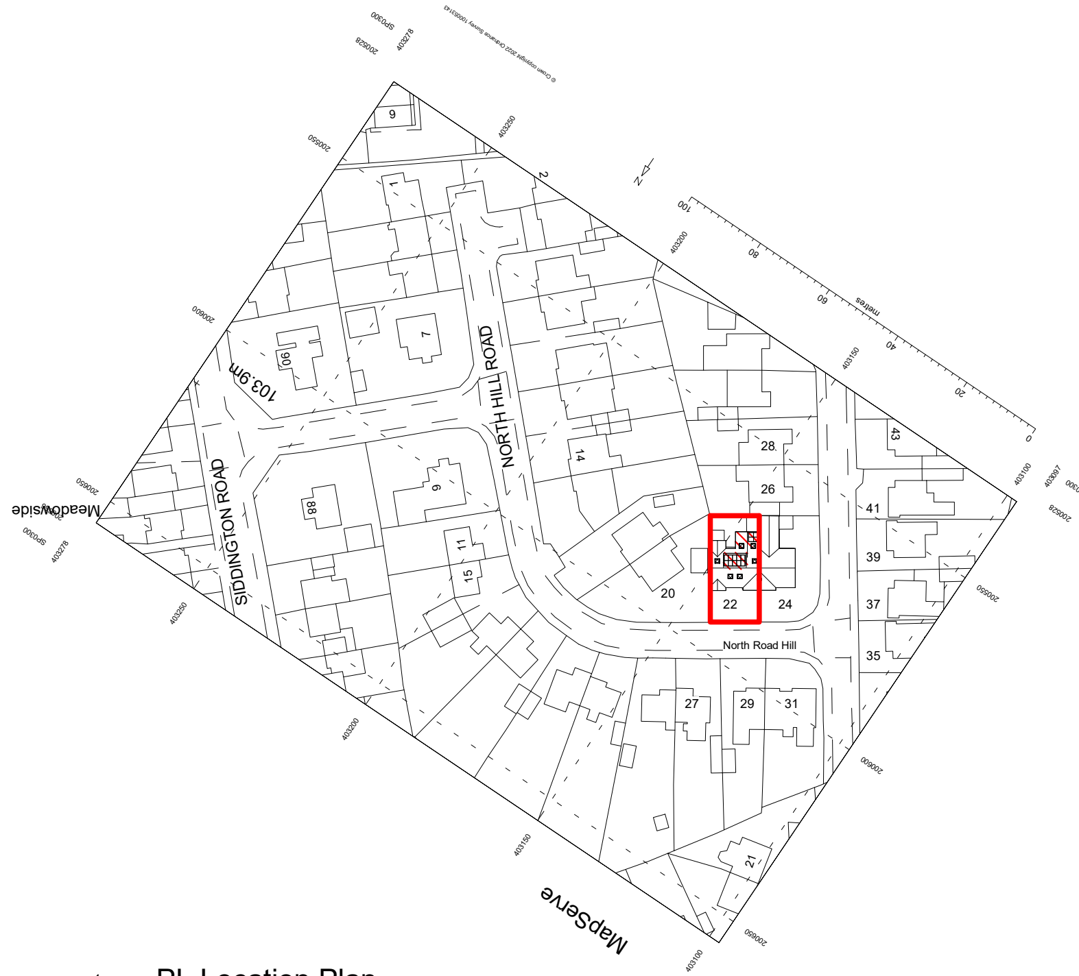
1 PL Location Plan PL01 1 : 1250