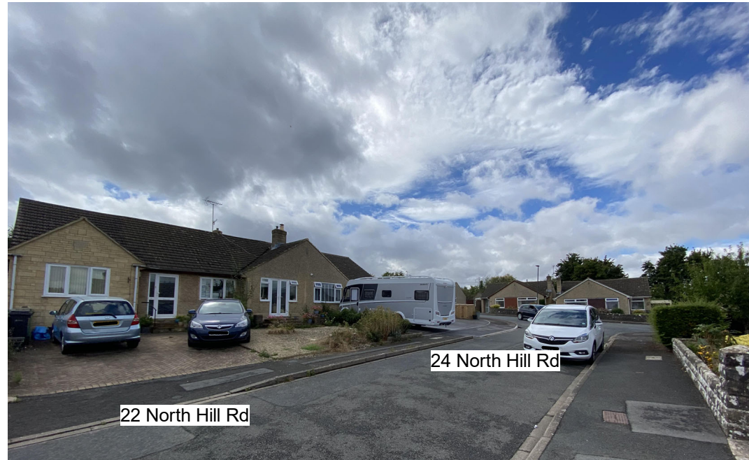
22 North Hill Rd