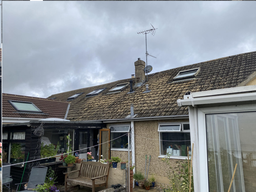
22 North Hill Rd - Garden