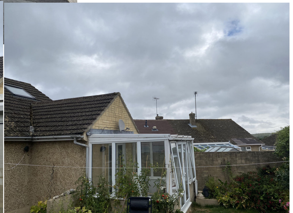
22 North Hill Rd - Garden