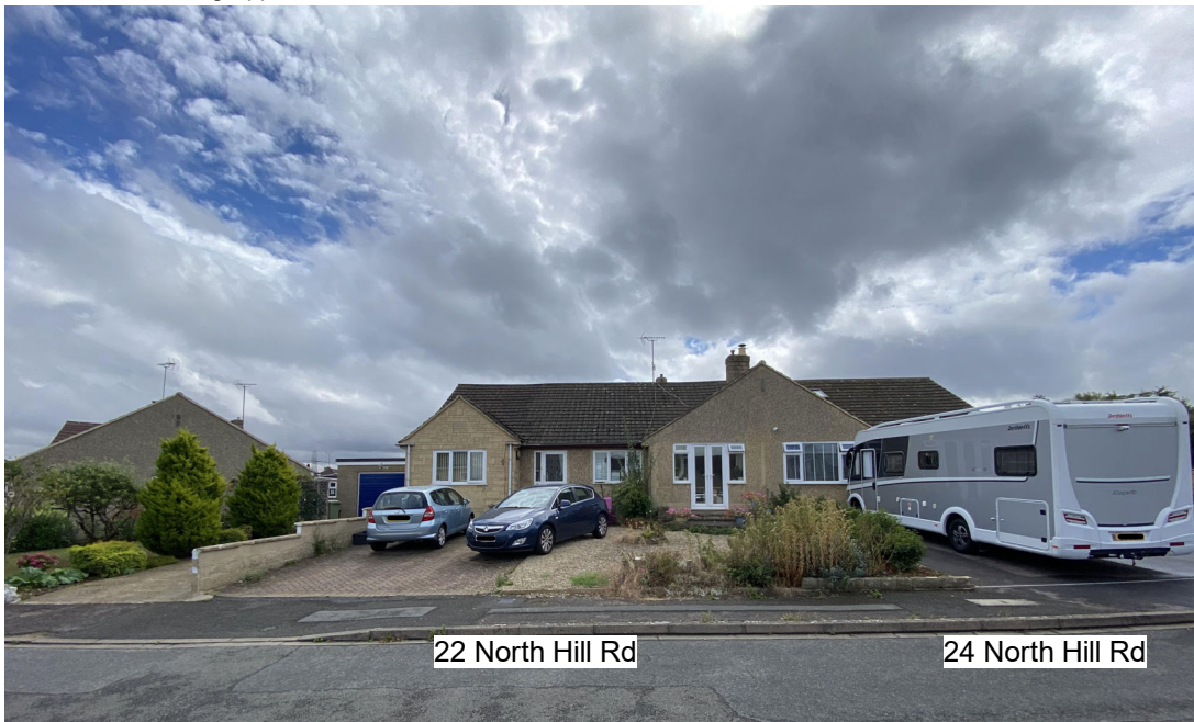
22 North Hill Rd