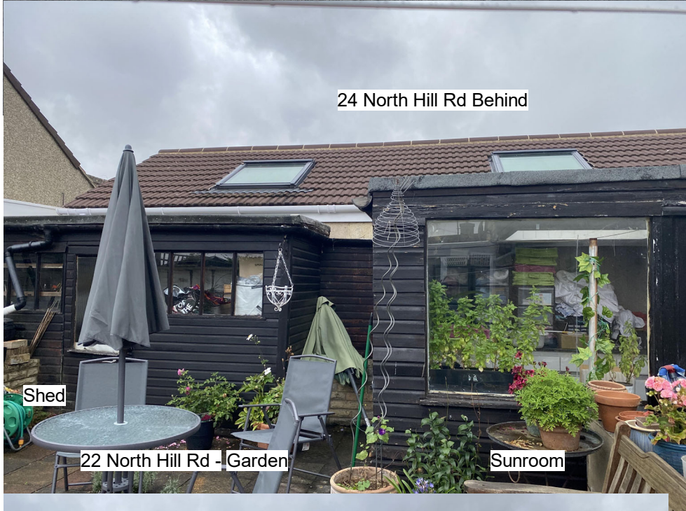
24 North Hill Rd Behind