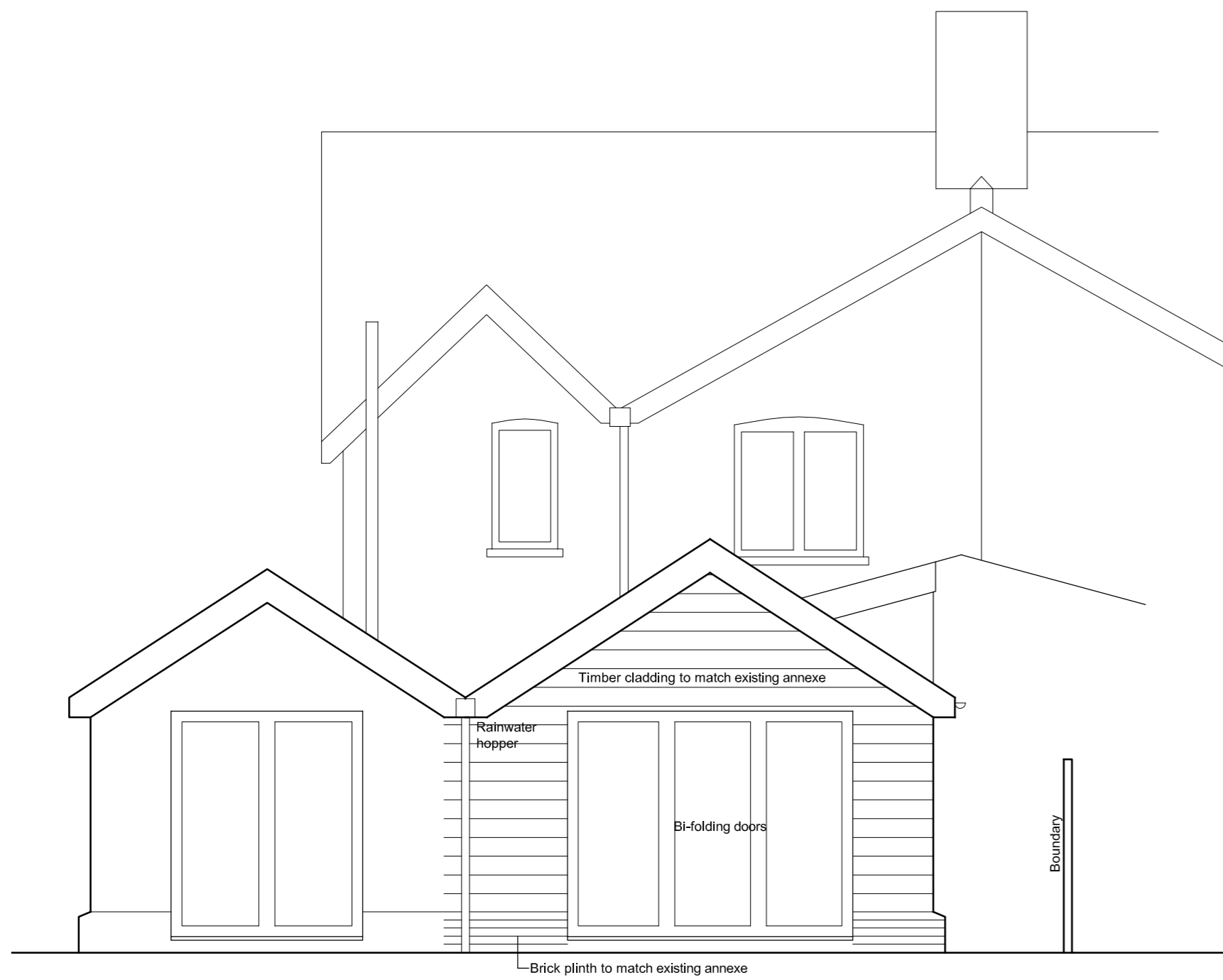
Proposed North Elevation SCALE 1-50@A2